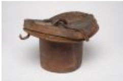
Clothing accessory: Top hat case owned by P. T. Barnum (1971.002.001 B)