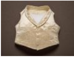
Textile: Wedding vest belonging to Charles S. Stratton (1976.001.096)