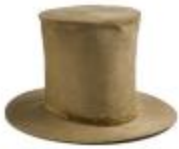
Textile: P. T. Barnum's Top Hat (1971.002.001 A)