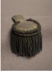
Textile: Miniature Epaulet worn by Charles S. Stratton (Gen. Tom Thumb) (1936.006.001)