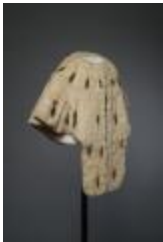
Textile: Fur cape belonging to M. Lavinia Warren (1976.001.035)