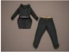
Textile: Black wool suit belonging to Charles S. Stratton (General Tom Thumb) (1888.002.001 AB)