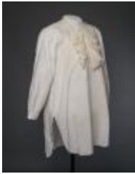
Textile: Dress shirt with ruffle worn by P. T. Barnum (2003.009.016)