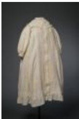
Textile: Nightgown belonging to M. Lavinia Warren (1976.001.008)