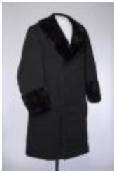
Textile: Winter coat belonging to P. T. Barnum (1969.001.001)