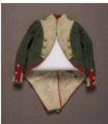
Textile: Napoleon costume jacket belonging to Charles S. Stratton (2017.004.001)