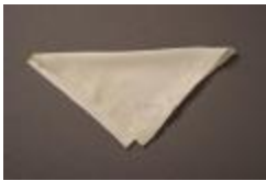
Clothing accessory: Handkerchief with P. T. Barnum signature (T 2014.001.001)