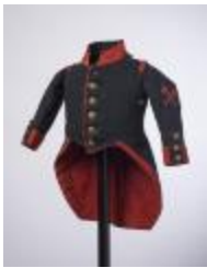
Textile: Military style jacket belonging to Charles S. Stratton (2014.006.001)