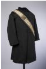
Textile: Masonic uniform jacket and accessories belonging to Charles S. Stratton (2014.007.001 AD)