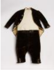
Textile: Charles S. Stratton's Court Suit, 1844 (T 2008.005.001 AB)