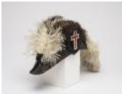
Textile: Masonic uniform hat belonging to Charles S. Stratton (2014.007.001 E)