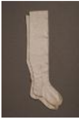
Textile: Pair of stockings belonging to M. Lavinia Warren (EL 1988.158.001 AB)