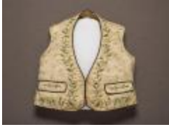
Textile: Miniature embroidered silk vest belonging to Charles S. Stratton (1976.001.099)