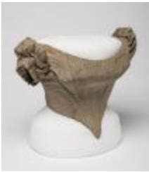
Textile: Bodice belonging to M. Lavinia Warren (T 2015.001.001)