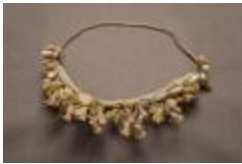
Textile: Bridal headpiece belonging to M. Lavinia Warren (T 2017.004.001)