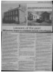
Lessons of the past-East Windsor Society hopes to refurbish historic schoolhouse. Article from the Journal Inquirer, dated April 14, 1998. (2019.000.0131)