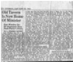
Newspaper Article - Old Tavern is now Home of Minister (2019.000.0138)