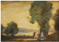
Untitled (Ladies at Lakeside Glen) (83.10)