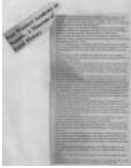
East Windsor Academy at Scantic,, A Museum of Local History (newspaper clipping) (2019.000.0112)