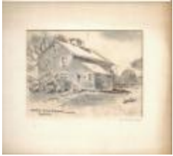
Original Drawing of Chuck Hill Farm Preston (Coll. 001 Fold. 021 Doc. 001)