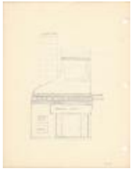
Drawing of Paul Park fireplace (Coll. 003 Vol. 002 Photo 060)