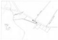
Diagram of Poquetanuck area (Coll. 003 Fold. 075 Doc. 010)