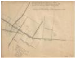
Diagram of Poquetanuck property ownership before 1800 (Coll. 003 Fold. 075 Doc. 007)