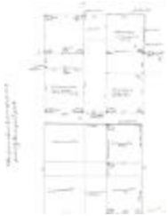
House diagram for unknown house (Coll. 003 Fold. 075 Doc. 001)