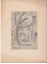
Original pencil sketch "Myrtle's Shop, Preston City" (Coll. 001 Fold. 013 Doc. 001)