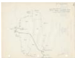
#168 K. Klemchuk pencil land drawing 1839 (Coll. 003 Vol. 002)