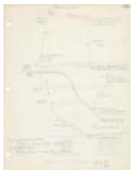
#167 Viola Johnson farm - drawn maps (Coll. 003 Vol. 002 Doc. 101)