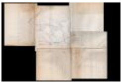
Large Map of Long Society 1723-1838 (Coll. 003 Fold. 069 Doc. 017)