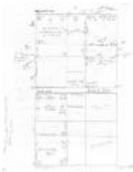
House drawing for unknown house (Coll. 003 Fold. 075 Doc. 003)