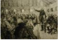
Preventing a Military Dictatorship, from the portfolio, The Bicentennial Pageant of George Washington (1436)