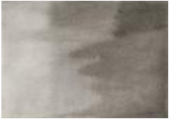
Untitled, Cranberry Island, 17/8/86;Untitled, Cranberry Island, 17/8/86 (99.8)