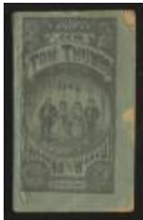
Book: "Tom Thumb's Three Years Tour Around the World" (front and back covers only) (EL 1988.086.001)