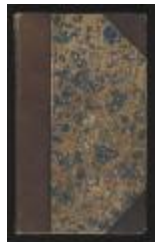
Book: "Tom Thumb's Three Years Tour Around the World" (inscribed copy) (EL 1988.087.001)