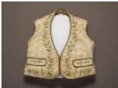
Textile: Miniature embroidered silk vest belonging to Charles S. Stratton (1976.001.099)