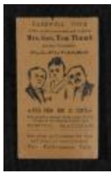
Ticket: Ticket for the Farewell Tour of Mrs. Gen. Tom Thumb and the Wonderful Liliputians (T 2016.025.001)