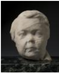
Sculpture: Cemetery monument of Charles S. Stratton's head, 1857 (1972.004.001)