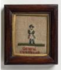
Textile: Needlework embroidered picture of "General Tom Thumb" (2012.003.001)