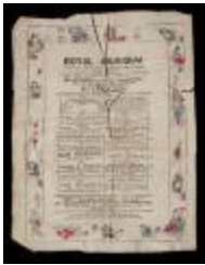
Program: Royal Aquarium Entertainments for July 14, 1888 (2012.011.007)