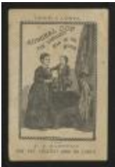
Booklet: "Admiral Dot, the Smallest Man in the World" (BF 1989.101.001)