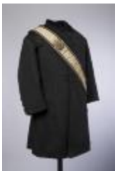
Textile: Masonic uniform jacket and accessories belonging to Charles S. Stratton (2014.007.001 AD)