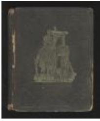
Book: "Life and Travels of Thomas Thumb in the United States, England, France, and Belgium with Illustrations of Him in His Different Costumes" (2014.010.001)