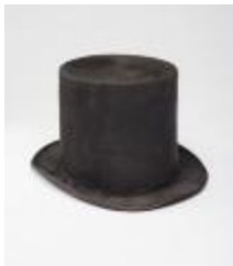
Textile: Miniature top hat belonging to Charles S. Stratton (EL 1988.111.001)