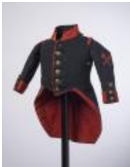
Textile: Military style jacket belonging to Charles S. Stratton (2014.006.001)