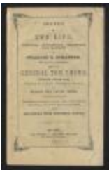
Book: "Sketch of the Life, Personal Appearance, Character and Manners of Charles S. Stratton" (EL 1988.160.001)