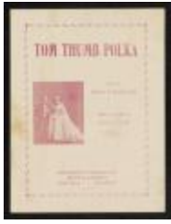
Sheet Music: "Tom Thumb Polka" with a "History of Mr. and Mrs. Tom Thumb" (EL 1988.153.001)