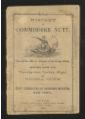
Booklet: "History of Commodore Nutt" (EL 1988.159.001)