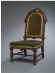
Furniture: Chair belonging to Charles S. Stratton (EL 1988.052.001)