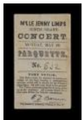
Ticket: "M'lle Jenny Lind's Ninth Grand Concert Ticket" (T 2014.022.001)