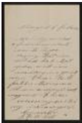
Letter: To Tilly? from George Washington Morrison Nutt, February 4, 1862 (MS 0002.209.001)