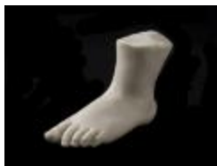
Sculpture: Replica Foot of Charles S. Stratton (Gen. Tom Thumb) (EL 1988.122.1)