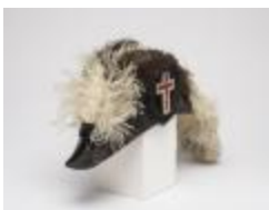
Textile: Masonic uniform hat belonging to Charles S. Stratton (2014.007.001 E)