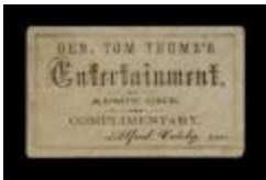
Ticket: "Gen. Tom Thumb's Entertainment" (EL 1988.266.001)