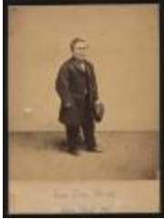
Photograph: Charles S. Stratton, full length portrait against plain background (EL 1989.184.001)