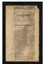
Newspaper: Article "Yachting" from Brooklyn Eagle listing Capt. Stratton (General Tom Thumb) (T 2016.019.001)