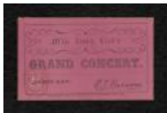
Ticket: "Mlle Jenny Lind's Grand Concert" (T 2009.041.001)