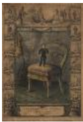
Print: "General Tom Thumb" by N. Currier (T 2013.024.001)