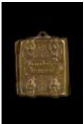
Jewelry: Fairy Wedding souvenir locket (BF 1995.019.001)