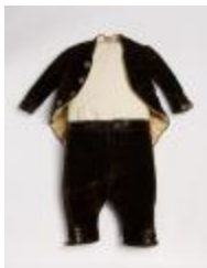
Textile: Charles S. Stratton's Court Suit, 1844 (T 2008.005.001 AB)