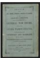
Book: "Sketch of the Life of General Tom Thumb and Lavinia Warren Stratton", 1867 (covers only) (T 2014.033.001)