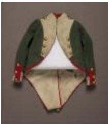
Textile: Napoleon costume jacket belonging to Charles S. Stratton (2017.004.001)