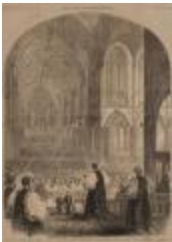
Newspaper: "The Fairy Wedding - The Marriage Ceremony of Charles S. Stratton (Gen. Tom Thumb) and Miss Lavinia Warren (The Queen of Beauty)" from Frank Leslie's Illustrated Newspaper (black and white) (EL 1988.076.001)