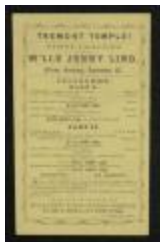
Program: Program for "First Concert of M'lle Jenny Lind" at Tremont Temple, Boston (T 2016.033.001)