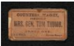
Ticket: "Countess Magri formerly Mrs. Gen. Tom Thumb" (EL 1988.276.001 AB)