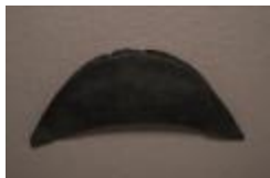
Textile: Bicorne hat belonging to Charles S. Stratton (EL 1988.126.001)