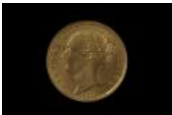
Physical object: Brass token with Queen Victoria and Charles S. Stratton (2000.007.001)