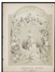
Sheet Music: "Jenny Lind's Greeting to America" (T 2016.054.001)