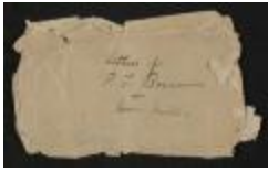
Letter: Letter from P.T. Barnum to George Washington Morrison Nutt, undated (envelope only) (BM-MSS 002 S01 B01F08)