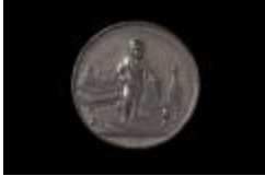
Physical object: Token featuring Charles S. Stratton (Gen. Tom Thumb), his history on reverse (2004.005.011)