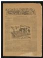
Newspaper: The Clipper with article about M. Lavinia Warren and Primo Magri (T 2016.020.001)