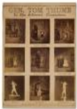
Photograph: "General Tom Thumb in His Different Characters, ca. 1850s" (EL 1988.084.001)