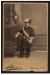
Photograph: Charles S. Stratton in Masonic uniform (owned by the Barnum Museum) (2003.009.069)