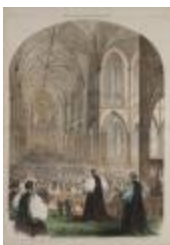
Newspaper: "The Fairy Wedding - The Marriage Ceremony of Charles S. Stratton (Gen. Tom Thumb) and Miss Lavinia Warren (the Queen of Beauty)", Frank Leslie's Illustrated, color version (T 2013.011.001)