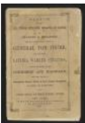
Book: "Sketch of the Life of General Tom Thumb and Lavinia Warren Stratton", 1867 (covers only) (T 2014.034.001)