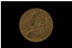
Physical object: Brass token with Lady Liberty and General Tom Thumb (2000.007.003)