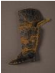
Textile: Miniature tall boot belonging to Charles S. Stratton (EL 1988.119.001)