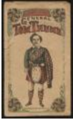
Toys and games: General Tom Thumb paper doll set (partial) (EL 1988.105.001)