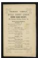
Program: Program for Jenny Lind's First and Second Grand Concerts at Tremont Temple, Boston (T 2016.034.001)