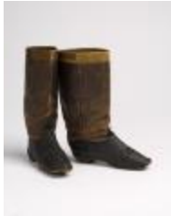
Textiles: Miniature boots belonging to Charles S. Stratton (EL 1988.117.001 AB)