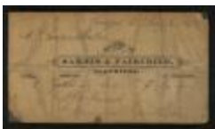
Document: Receipt to Charles S. Stratton from Sammis & Fairchild Clothiers, 1872 (EL 1988.277.001)