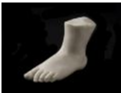
Sculpture: Replica Foot of Charles S. Stratton (Gen. Tom Thumb) (EL 1988.122.1)