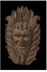
Architectural element: Decorative feature from Barnum's home, Iranistan (EL 1990.001.005)