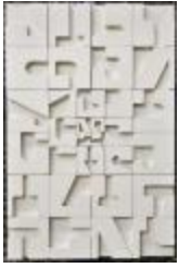
Mural Study (0050)