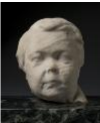
Sculpture: Cemetery monument of Charles S. Stratton's head, 1857 (1972.004.001)