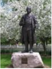
Henry Whitfield Statue (HW2003.005)