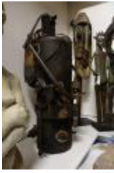
The Soldier (0088)