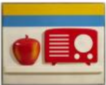
Still Life #53, 2/4 (0065)