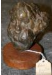
Grace #1 (0053)