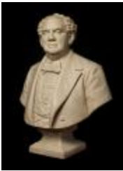
Sculpture: Bust of P. T. Barnum by Thomas Ball (1988.005.001)