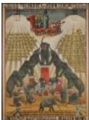
Poster: "Fifteen Trained Elephants in Towering Pedestal Pyramid" (2006.007.002)