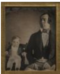
Photograph: Daguerreotype of Charles S. Stratton (General Tom Thumb) and his father, seated, 1843 (EL 1988.067.001)