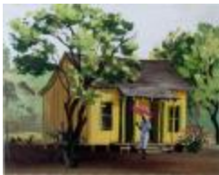
House at Brackettville, Texas (200)