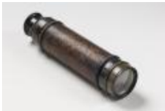
Transportation T & E: Nautical spyglass owned by Charles S. Stratton (EL 1988.129.001)