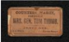
Ticket: "Countess Magri formerly Mrs. Gen. Tom Thumb" (EL 1988.276.001 AB)