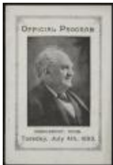
Program: "Unveiling of the Barnum Statue" (EL 1989.040.011)