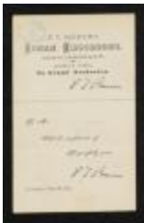
Ticket: "Complimentary ticket to P.T. Barnum's Roman Hippodrome, June 27, 1874" (2003.009.036)