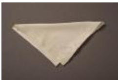
Clothing accessory: Handkerchief with P. T. Barnum signature (T 2014.001.001)