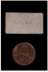
Calling Card: Calling card for "Gen. Tom Thumb" (1977.003.001)