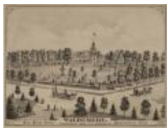
Print: "Waldemere, Home of Hon. P. T. Barnum" (T 2016.040.001)