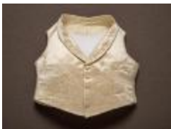
Textile: Wedding vest belonging to Charles S. Stratton (1976.001.096)