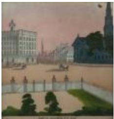
Physical object: Clock component, Painted glass panel from mantel clock, "View in Broadway, New York" (2015.009.001)