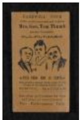
Ticket: Ticket for the Farewell Tour of Mrs. Gen. Tom Thumb and the Wonderful Liliputians (T 2016.025.001)