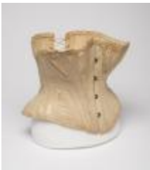
Underwear: Corset belonging to M. Lavinia Warren (BF 1993.018.003 AB)