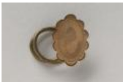
Jewelry: Cufflink belonging to Charles S. Stratton (1976.001.109)