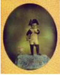
Photograph: General Tom Thumb (Charles S. Stratton) as Napoleon (1943.003.001)