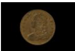
Physical object: Brass token with Lady Liberty and General Tom Thumb (2000.007.003)