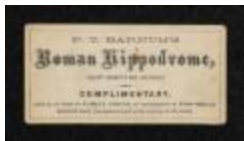
Ticket: Complimentary ticket to "P. T. Barnum's Roman Hippodrome" (EL 1988.022.005)