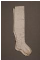
Textile: Pair of stockings belonging to M. Lavinia Warren (EL 1988.158.001 AB)