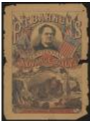
Courier: P. T. Barnum's Centennial Advanced Daily (T 2016.006.001)