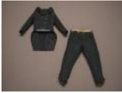
Textile: Black wool suit belonging to Charles S. Stratton (General Tom Thumb) (1888.002.001 AB)