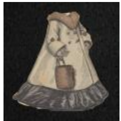
Toys and games: M. Lavinina Warren paper doll, winter coat with fur collar and muff (2003.009.062 G)