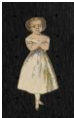
Toys and games: Minnie Warren paper doll, figure in undergarments (2003.009.062 H)