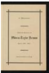
Program: Memorial Program from P.T. Barnum's Funeral (T 2016.030.001)