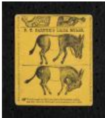
Advertisement: Puzzle featuring "P. T. Barnum's Trick Mules" (2003.009.073)