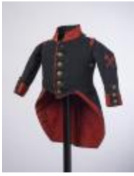
Textile: Military style jacket belonging to Charles S. Stratton (2014.006.001)