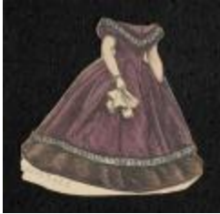
Toys and games: M. Lavinina Warren paper doll, burgundy dress (2003.009.062 C)