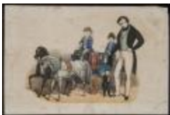
Print: Charles S. Stratton (General Tom Thumb ) next to his miniature carriage (T 2015.059.001)