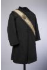
Textile: Masonic uniform jacket and accessories belonging to Charles S. Stratton (2014.007.001 AD)