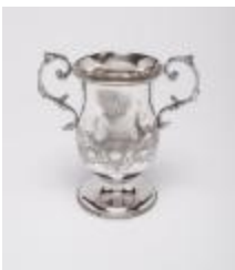
Food service: Silver spoon holder with initials of P. T. Barnum (EL 1989.016.001)