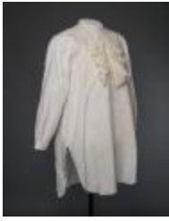
Textile: Dress shirt with ruffle worn by P. T. Barnum (2003.009.016)