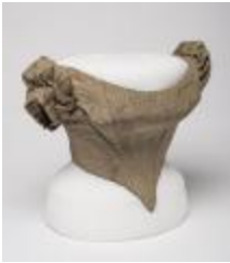
Textile: Bodice belonging to M. Lavinia Warren (T 2015.001.001)