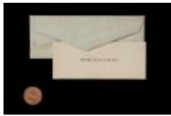
Physical object: Calling card for Mr. and Mrs. Charles S. Stratton (T 2016.026.001 AB)