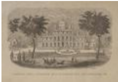
Print: "Oriental Villa - Residence of P.T. Barnum, Esq., at Bridgeport, CT" (T 2014.020.001)