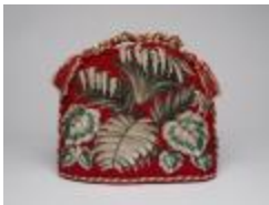
Food service: Tea cozy belonging to P. T. Barnum (2003.009.079)