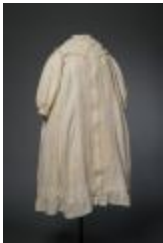
Textile: Nightgown belonging to M. Lavinia Warren (1976.001.008)