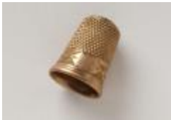
Textile equipment: Thimble belonging to M. Lavinia Warren (1981.004.009)