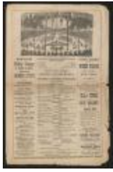
Advertisement: Ad for P.T. Barnum's Hippodrome at Back Bay in Boston (BF 1994.007.002)