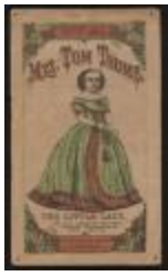
Toys and games: M. Lavinia Warren paper doll set (partial) with two dresses (EL 1988.106.001)