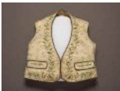
Textile: Miniature embroidered silk vest belonging to Charles S. Stratton (1976.001.099)