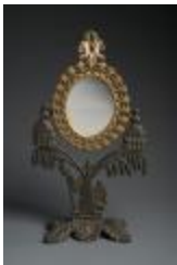
Decorative object: Dressing table mirror with Jenny Lind figures (T 2015.054.001)