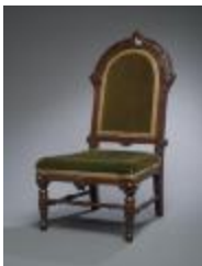
Furniture: Chair belonging to Charles S. Stratton (EL 1988.052.001)