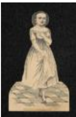
Toys and games: M. Lavinina Warren paper doll, figure in undergarments (2003.009.062 A)