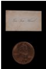
Calling Card: Calling card for "Gen. Tom Thumb" (T 2016.029.001)