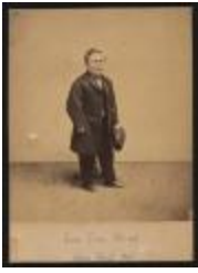
Photograph: Charles S. Stratton, full length portrait against plain background (EL 1989.184.001)