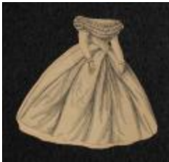
Toys and games: M. Lavinia Warren paper doll dresses in white and pink (EL 1988.107.001)