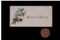
Physical object: Calling card for Minnie A. Warren (T 2016.027.001)