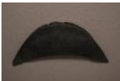
Textile: Bicorn hat belonging to Charles S. Stratton (EL 1988.126.001)