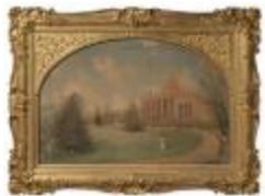
Painting: View of Iranistan from southeast vantage point (1996.009.001)