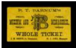
Ticket: "Whole Ticket to P. T. Barnum's Museum and Menagerie" (EL 1988.022.001)