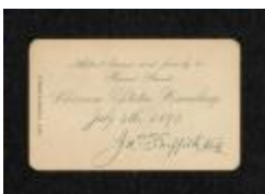
Ticket: Ticket to unveiling of the P. T. Barnum statue, 1893 (2003.009.011)