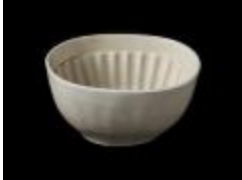
Food service: Ironstone pudding mold with elephant (EL 1989.006.001)