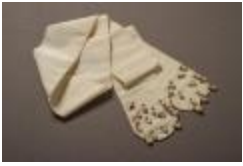
Textile: Dress sash belonging to Minnie Warren (T 2017.005.001)