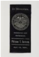
Textile: Memorial ribbon for P. T. Barnum's funeral (MS 002.117.001)