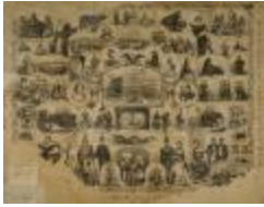
Poster: "Barnum's American Museum, Performance Three Times Daily, [Sun]rise till 10" (T 2014.025.001)