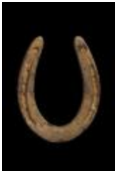
Transportation T & E: Horseshoe belonging to one of Charles S. Stratton's ponies (EL 1988.141.001 )