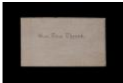
Calling Card: Calling card for "Gen. Tom Thumb" (T 2016.028.001)