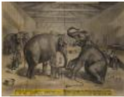
Print: "Interior View of Elephant Building," 1882 (T 2013.042.001)