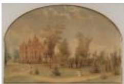
Painting: View of Iranistan seen from east vantage point (2006.005.003)