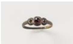
Jewelry: Garnet ring belonging to Charles S. Stratton (EL 1988.182.003)