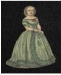
Toys and games: M. Lavinina Warren paper doll, figure wearing green dress (2003.009.062 B)