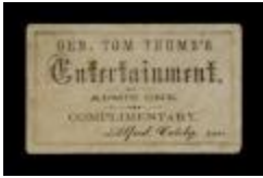
Ticket: "Gen. Tom Thumb's Entertainment" (EL 1988.266.001)