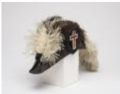
Textile: Masonic uniform hat belonging to Charles S. Stratton (2014.007.001 E)