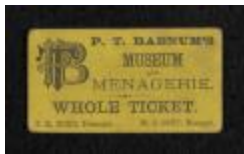
Ticket: "P. T. Barnum's Museum and Menagerie Whole Ticket" (EL 1988.022.002)