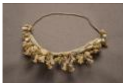
Textile: Bridal headpiece belonging to M. Lavinia Warren (T 2017.004.001)