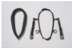
Transportation T & E: Pony collar and hames (T 2016.061.002 AB)