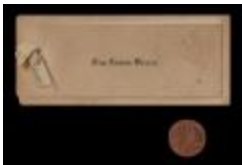
Calling card: Dual calling card for Miss Lavinia Warren and Charles S. Stratton (1981.002.001)