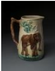
Food Service: Pitcher featuring Jumbo the elephant (EL 1989.007.001)