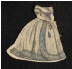
Toys and games: M. Lavinina Warren paper doll, white and blue dress (2003.009.062 F)