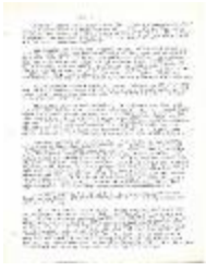
#140 The Witter House (Coll. 003 Vol. 002 Doc. 072)