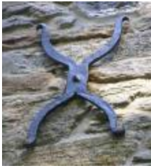
Stone Anchor (HW1973.191b)