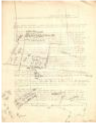
Diagram of property off of School House Rd., Preston (Coll. 003 Fold. 075 Doc. 006)