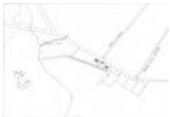
Diagram of Poquetanuck area (Coll. 003 Fold. 075 Doc. 010)