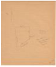
Lot Diagram Edw. Mott to Calvin Barstow (Coll. 003 Fold. 090 Doc. 012)