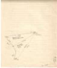
Lot Diagram #285 Witter to Mott (Coll. 003 Fold. 090 Doc. 014)