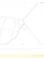
Preston City blank diagram (Coll. 003 Fold. 076 Doc. 003)