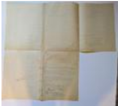
#367 Capt. Williams Property (Coll. 003 Fold. 075 Doc. 008)