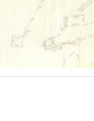
Preston City 1758 diagram (Coll. 003 Fold. 076 Doc. 004)