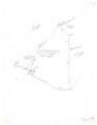
Whipple to Capron land drawing (Coll. 003 Fold. 075 Doc. 026)