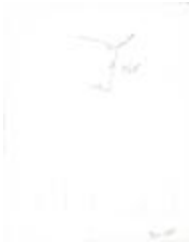
Jon. Whipple land (Coll. 003 Fold. 075 Doc. 024)