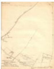
Poquetannock land drawing (Coll. 003 Fold. 075 Doc. 014)