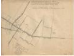
Diagram of Poquetanuck property ownership before 1800 (Coll. 003 Fold. 075 Doc. 007)