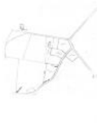
Preston City labeled diagram (Coll. 003 Fold. 076 Doc. 001)