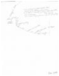
Poquetanuck Road in 1700s (Coll. 003 Fold. 075 Doc. 025)