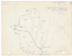
#168 K. Klemchuk pencil land drawing 1839 (Coll. 003 Vol. 002)