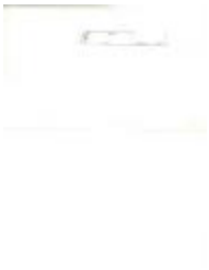
Preston City diagram - no labels (Coll. 003 Fold. 076 Doc. 002)