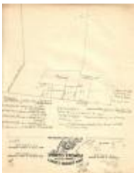
Punderson land history (Coll. 003 Fold. 075 Doc. 013)