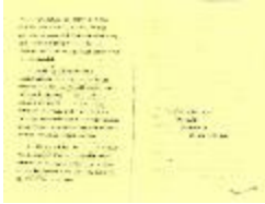
A Brief History of Amos Place (Coll. 003 Fold. 077 Doc. 048)