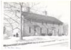
The Poor House (Coll. 003 Vol. 015 Photo 009)