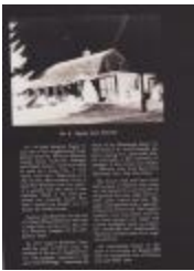
Captain John Brewster (Photographs Fold. 010 Photo 18. 8)