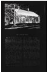
The Poor Farm (Photographs Fold. 010 Photo 18.9)