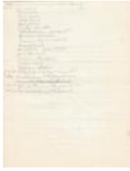
1839 A memorandum of the poor Famalys (Coll. 003 Fold. 051 Doc. 012)