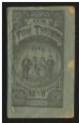
Book: "Tom Thumb's Three Years Tour Around the World" (front and back covers only) (EL 1988.086.001)