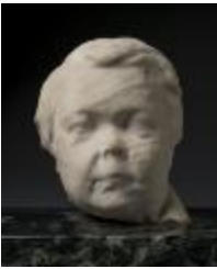
Sculpture: Cemetery monument of Charles S. Stratton's head, 1857 (1972.004.001)