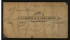
Document: Receipt to Charles S. Stratton from Sammis & Fairchild Clothiers, 1872 (EL 1988.277.001)