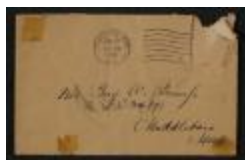
Letter: My dear brother and sister Edith from Sister Vinnie (M. Lavinia Warren), June 20, 1915 (MS 0003.106.002)