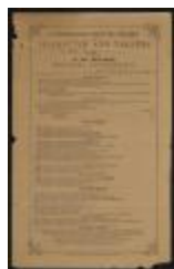
Document: Phrenology chart for M. Lavinia Warren, 1871 (MS 0003.117.001)