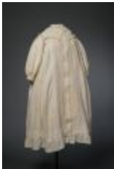
Textile: Nightgown belonging to M. Lavinia Warren (1976.001.008)