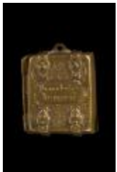
Jewelry: Fairy Wedding souvenir locket (BF 1995.019.001)