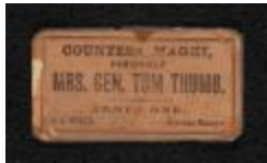
Ticket: "Countess Magri formerly Mrs. Gen. Tom Thumb" (EL 1988.276.001 AB)