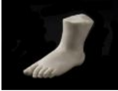
Sculpture: Replica Foot of Charles S. Stratton (Gen. Tom Thumb) (EL 1988.122.1)