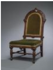
Furniture: Chair belonging to Charles S. Stratton (EL 1988.052.001)