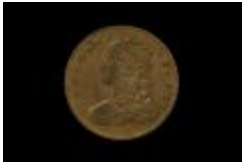
Physical object: Brass token with Lady Liberty and General Tom Thumb (2000.007.003)