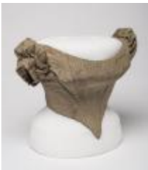
Textile: Bodice belonging to M. Lavinia Warren (T 2015.001.001)