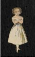
Toys and games: Minnie Warren paper doll, figure in undergarments (2003.009.062 H)