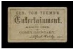
Ticket: "Gen. Tom Thumb's Entertainment" (EL 1988.266.001)