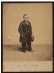
Photograph: Charles S. Stratton, full length portrait against plain background (EL 1989.184.001)