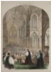
Newspaper: "The Fairy Wedding - The Marriage Ceremony of Charles S. Stratton (Gen. Tom Thumb) and Miss Lavinia Warren (the Queen of Beauty)", Frank Leslie's Illustrated, color version (T 2013.011.001)