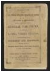
Book: "Sketch of the Life of General Tom Thumb and Lavinia Warren Stratton", 1867 (covers only) (T 2014.034.001)