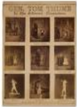
Photograph: "General Tom Thumb in His Different Characters, ca. 1850s" (EL 1988.084.001)