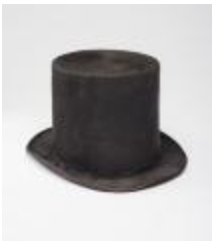
Textile: Miniature top hat belonging to Charles S. Stratton (EL 1988.111.001)