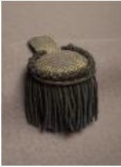
Textile: Miniature Epaulet worn by Charles S. Stratton (Gen. Tom Thumb) (1936.006.001)