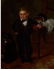
Painting: "Portrait of Charles Sherwood Stratton with a Dog" (1936.005.001)