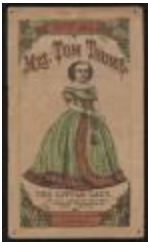
Toys and games: M. Lavinia Warren paper doll set (partial) with two dresses (EL 1988.106.001)