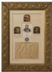
Framed items: P. T. Barnum's Tom Thumb Memorial Archive (T 2016.037.001)