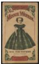
Toys and games: Minnie Warren paper doll set (EL 1988.107.001)