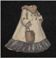
Toys and games: M. Lavinina Warren paper doll, winter coat with fur collar and muff (2003.009.062 G)