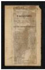
Newspaper: Article "Yachting" from Brooklyn Eagle listing Capt. Stratton (General Tom Thumb) (T 2016.019.001)