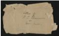
Letter: Letter from P.T. Barnum to George Washington Morrison Nutt, undated (envelope only) (BM-MSS 002 S01 B01F08)