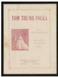
Sheet Music: "Tom Thumb Polka" with a "History of Mr. and Mrs. Tom Thumb" (EL 1988.153.001)