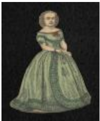
Toys and games: M. Lavinina Warren paper doll, figure wearing green dress (2003.009.062 B)