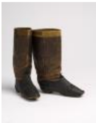
Textiles: Miniature boots belonging to Charles S. Stratton (EL 1988.117.001 AB)