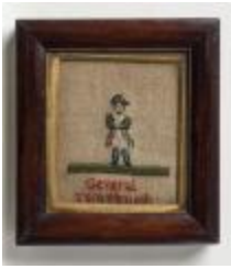
Textile: Needlework embroidered picture of "General Tom Thumb" (2012.003.001)