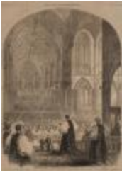
Newspaper: "The Fairy Wedding - The Marriage Ceremony of Charles S. Stratton (Gen. Tom Thumb) and Miss Lavinia Warren (The Queen of Beauty)" from Frank Leslie's Illustrated Newspaper (black and white) (EL 1988.076.001)