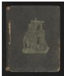
Book: "Life and Travels of Thomas Thumb in the United States, England, France, and Belgium with Illustrations of Him in His Different Costumes" (2014.010.001)