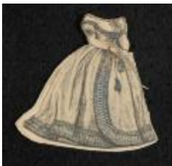
Toys and games: M. Lavinina Warren paper doll, white and blue dress (2003.009.062 F)