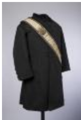
Textile: Masonic uniform jacket and accessories belonging to Charles S. Stratton (2014.007.001 AD)