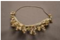
Textile: Bridal headpiece belonging to M. Lavinia Warren (T 2017.004.001)