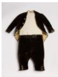
Textile: Charles S. Stratton's Court Suit, 1844 (T 2008.005.001 AB)