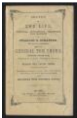
Book: "Sketch of the Life, Personal Appearance, Character and Manners of Charles S. Stratton" (EL 1988.160.001)