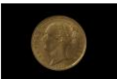
Physical object: Brass token with Queen Victoria and Charles S. Stratton (2000.007.001)