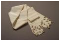
Textile: Dress sash belonging to Minnie Warren (T 2017.005.001)