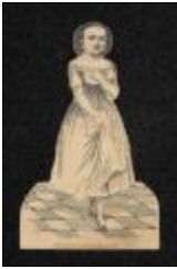
Toys and games: M. Lavinina Warren paper doll, figure in undergarments (2003.009.062 A)