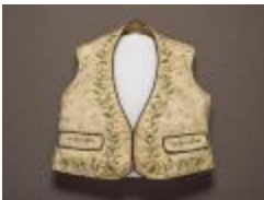
Textile: Miniature embroidered silk vest belonging to Charles S. Stratton (1976.001.099)