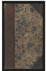
Book: "Tom Thumb's Three Years Tour Around the World" (inscribed copy) (EL 1988.087.001)