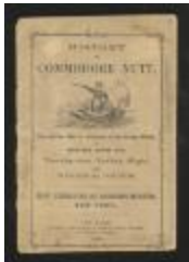
Booklet: "History of Commodore Nutt" (EL 1988.159.001)