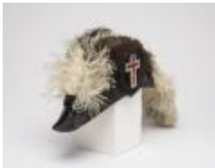
Textile: Masonic uniform hat belonging to Charles S. Stratton (2014.007.001 E)