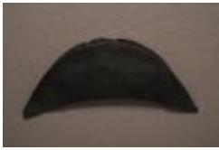
Textile: Bicorne hat belonging to Charles S. Stratton (EL 1988.126.001)