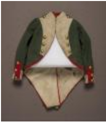
Textile: Napoleon costume jacket belonging to Charles S. Stratton (2017.004.001)