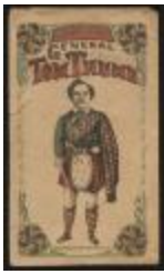
Toys and games: General Tom Thumb paper doll set (partial) (EL 1988.105.001)