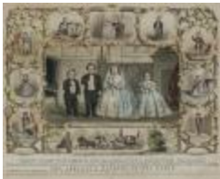
Print: "The Fairy Wedding" of General Tom Thumb (Charles S. Stratton) by Currier and Ives (T 2016.048.001)