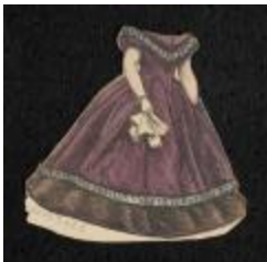
Toys and games: M. Lavinina Warren paper doll, burgundy dress (2003.009.062 C)