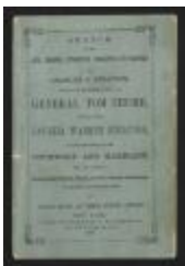
Book: "Sketch of the Life of General Tom Thumb and Lavinia Warren Stratton", 1867 (covers only) (T 2014.033.001)