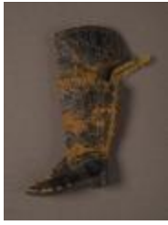
Textile: Miniature tall boot belonging to Charles S. Stratton (EL 1988.119.001)