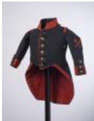
Textile: Military style jacket belonging to Charles S. Stratton (2014.006.001)