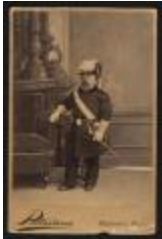
Photograph: Charles S. Stratton in Masonic uniform (owned by the Barnum Museum) (2003.009.069)