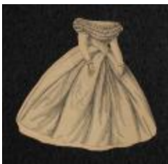
Toys and games: M. Lavinia Warren paper doll dresses in white and pink (EL 1988.107.001)