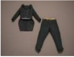
Textile: Black wool suit belonging to Charles S. Stratton (General Tom Thumb) (1888.002.001 AB)