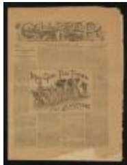
Newspaper: The Clipper with article about M. Lavinia Warren and Primo Magri (T 2016.020.001)