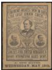
Courier: Advance Courier of Barnum's Greatest Show on Earth and the Great London Circus for May 18, 1881 (T 2015.055.001)