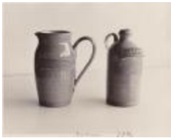
Preston Bicentennial commemorative pottery (Photographs Fold. 002 Photo 040)