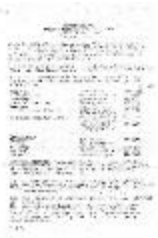
Preston Historical Society Newsletter Nov. 1976 (Coll. 003 Fold. 077 Doc. 028)