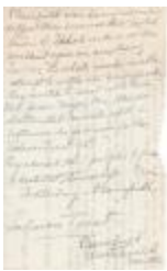
Plainfield Bicentennial - note referring to Salmon Treat (Coll. 003 Fold. 046 Doc. 002)