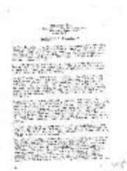
Preston Historical Society Newsletter Feb. 1975 (Coll. 003 Fold. 077 Doc. 025)