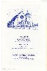
Saint James' Parish Choir Concert brochure (Coll. 001 Fold. 015 Doc. 002)