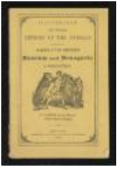
Booklet: "Illustrated and Descriptive History of the Animals..." with lion tamer on cover (T 2016.031.001)