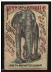
Booklet: "History of Animals and Leading Curiosities . . ." featuring Jumbo on cover (T 2014.045.001)