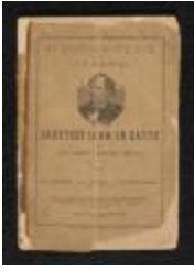
Book: Circus Route Book for 1883 (2003.009.025)