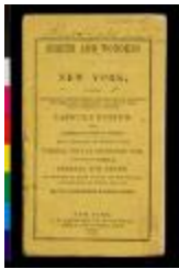
Booklet: "Sights and Wonders in New York" (T 2014.023.001)