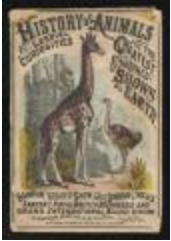
Booklet: "History of the Animals and Leading Curiosities . . ." with giraffe on cover (T 2016.032.001)