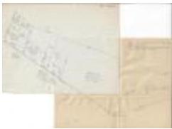
Preston City Lot Diagrams (Coll. 003 Fold. 092 Doc. 002)