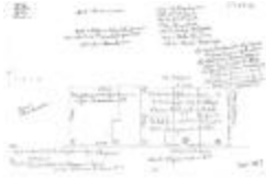
Lot Diagram #376 and #377 (Coll. 003 Fold. 091 Doc. 007)