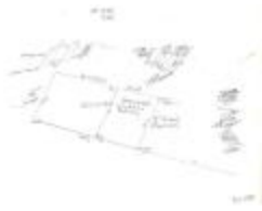
Lot Diagram #380-381 (Coll. 003 Fold. 091 Doc. 008)