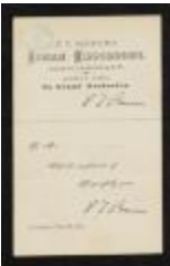
Ticket: "Complimentary ticket to P.T. Barnum's Roman Hippodrome, June 27, 1874" (2003.009.036)