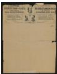
Stationery: Barnum and Bailey Greatest Show on Earth letterhead, circa 1880s (MS 0004.106.001)