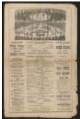
Advertisement: Ad for P.T. Barnum's Hippodrome at Back Bay in Boston (BF 1994.007.002)