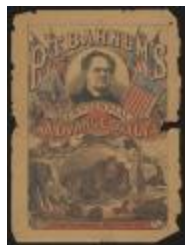
Courier: P. T. Barnum's Centennial Advanced Daily (T 2016.006.001)