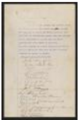
Document: Winter Quarters Petition, November 23, 1887 (MS 0004.114.001)