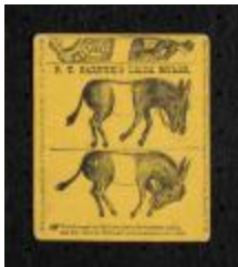
Advertisement: Puzzle featuring "P. T. Barnum's Trick Mules" (2003.009.073)