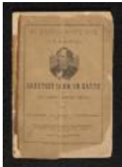
Book: Circus Route Book for 1883 (2003.009.025)