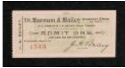
Ticket: Complimentary ticket to "The Barnum & Bailey Greatest Show on Earth" from J. A. Bailey (1998.014.001)