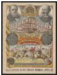
Courier: The Barnum and Bailey 15 New United Shows for Monday, April 22, 1889 (T 2015.057.001)