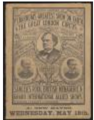
Courier: Advance Courier of Barnum's Greatest Show on Earth and the Great London Circus for May 18, 1881 (T 2015.055.001)