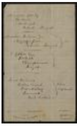
Document: Note written by P.T. Barnum regarding elephants, February 20, 1882 (2003.009.017)