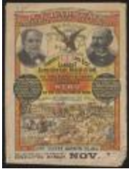
Courier: P.T. Barnum's Greatest Show on Earth in London, November 11, 1889 (T 2016.023.001)