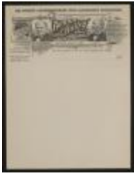
Stationery: Barnum and Bailey Greatest Show on Earth letterhead, circa 1900s (MS 0004.106.002)