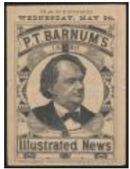
Courier: P. T. Barnum's Illustrated News, Hartford, Connecticut, May 5, 1880 (MS 0004.109.001)