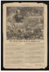
Advertisement: Ad for "P. T. Barnum's 'The World in Contribution'" in Harper's Weekly, March 29, 1873 (T 2016.017.001)