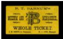
Ticket: "Whole Ticket to P. T. Barnum's Museum and Menagerie" (EL 1988.022.001)