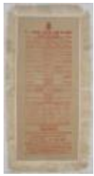
Program: "P. T. Barnum's Greatest Show on Earth Program" for Olympia, London, November 20, 1889 (owned by the Barnum Museum) (2003.009.133)