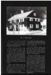
Thomas Gates (Photographs Fold. 010 Photo 18.6)