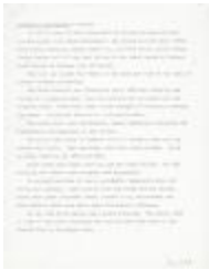
Historical Background - Preston (Coll. 002 Fold. 026 Doc. 009)