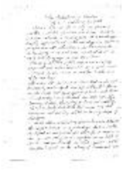
Photocopy of Early Industries in Preston (Coll. 002 Fold. 012 Doc. 002)