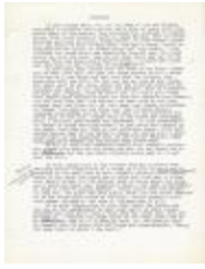
Cooktown (Coll. 003 Vol. 002 Doc. 076)