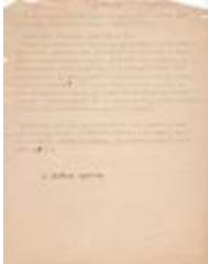
Information about Samuel Whipple (Coll. 002 Fold. 018 Doc. 032)