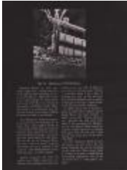
Mathewson's Mill Residence (Photographs Fold. 010 Photo 18.76)