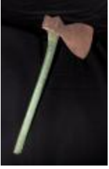
Tool - Broad Axe with Green Handle (79.532)