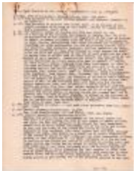
Notes from "Records of the State of Connecticut", vol 1, 1776-1778 (Coll. 003 Fold. 062 Doc. 002)