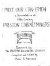
Meet Our Craftsmen (Coll. 002 Fold. 012 Doc. 003)