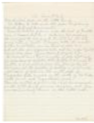
An Ancient Mill - Witter land (Coll. 003 Fold. 051 Doc. 025)