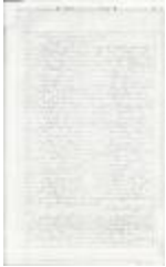
Photocopy of Jabez Avery letter, Ticonderoga 1775 (Coll. 002 Fold. 008 Doc. 012)