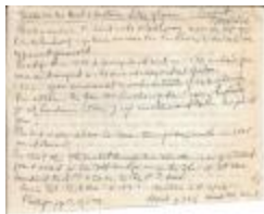
Guide to the History and Historic Sites of Connecticut (Crofut) (Coll. 003 Fold. 065 Doc. 002)