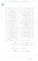
Photocopy of a Grant to Thomas Parke (Coll. 002 Fold. 008 Doc. 003)