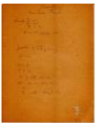
Brewster New London Town Records (Coll. 003 Fold. 072 Doc. 001)