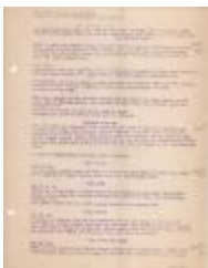
New London Grants and Deeds (Coll. 003 Fold. 072 Doc. 003)