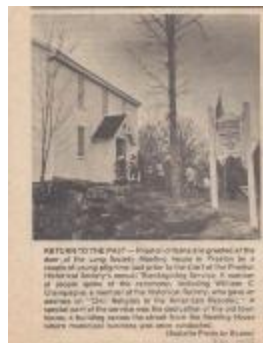
Return to the Past (Coll. 002 Fold. 022 Doc. 008)

Keeper of the Pound Gets History Job (Coll. 002 Fold. 020 Doc. 001)