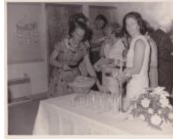
Preston Historical Society group photo (Photographs Fold. 009 Photo 179)