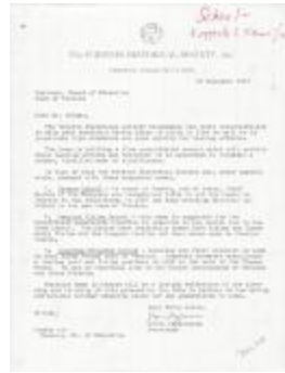
Suggested Names for School (Coll. 002 Fold. 030 Doc. 010)

Historical Society Seeks Permit (Coll. 002 Fold. 028 Doc. 014)