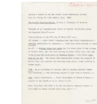
Records & Papers of the New London County Historical Society Part II, Volume II - New London, Conn. 1896 (Coll. 002 Fold. 022 Doc. 001)