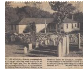
Future Museum (Coll. 002 Fold. 028 Doc. 013)