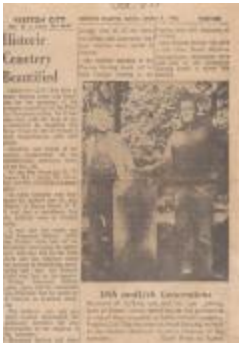
Historic Cemetery Beautified (Coll. 001 Fold. 003 Doc. 057)

More Work Set for Long Society Cemetery (Coll. 001 Fold. 003 Doc. 058)