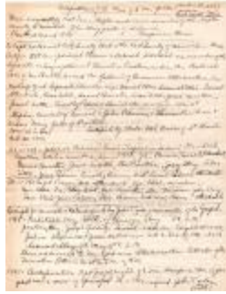
Certifications of Ch. Mem. of E. Soc. Folks (Coll. 003 Fold. 060 Doc. 014)