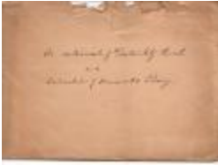
Bi-centennial of Preston City Church and Dedication of Monument & Library (Coll. 003 Fold. 060 Doc. 001)