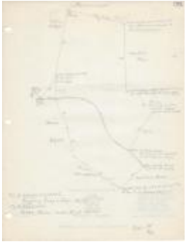
#167 Viola Johnson farm - drawn maps (Coll. 003 Vol. 002 Doc. 101)