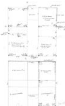
House diagram for unknown house (Coll. 003 Fold. 075 Doc. 001)