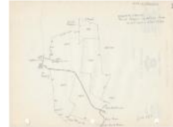
#168 K. Klemchuk pencil land drawing 1839 (Coll. 003 Vol. 002)