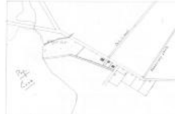
Diagram of Poquetanuck area (Coll. 003 Fold. 075 Doc. 010)