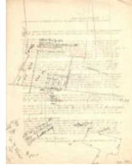
Diagram of property off of School House Rd., Preston (Coll. 003 Fold. 075 Doc. 006)