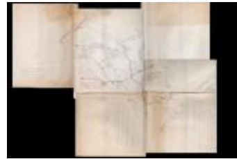
Large Map of Long Society 1723-1838 (Coll. 003 Fold. 069 Doc. 017)