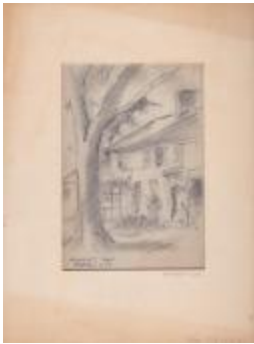
Original pencil sketch "Myrtle's Shop, Preston City" (Coll. 001 Fold. 013 Doc. 001)