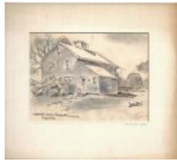
Original Drawing of Chuck Hill Farm Preston (Coll. 001 Fold. 021 Doc. 001)