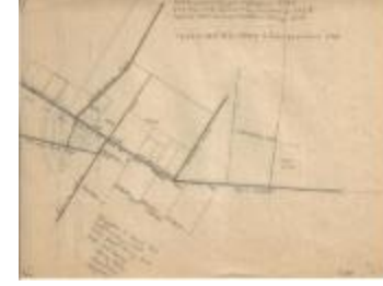
Diagram of Poquetanuck property ownership before 1800 (Coll. 003 Fold. 075 Doc. 007)