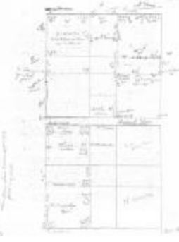
House drawing for unknown house (Coll. 003 Fold. 075 Doc. 003)