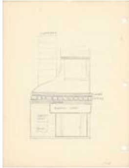
Drawing of Paul Park fireplace (Coll. 003 Vol. 002 Photo 060)