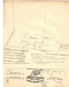
Punderson land history (Coll. 003 Fold. 075 Doc. 013)