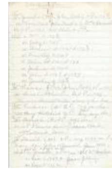
Starkweather Genealogy - Starting with Jerusha (Coll. 003 Fold. 042 Doc. 006)