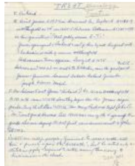
Treat Genealogy (Coll. 003 Fold. 046 Doc. 001)