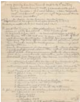
Descendants of Lieut. Thomas Tracy (Coll. 003 Fold. 045 Doc 003)