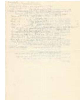
Bowdish records (Coll. 003 Fold. 053 Doc. 011)