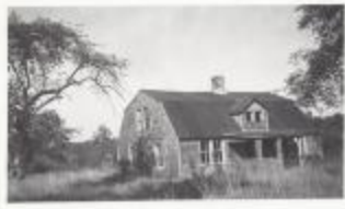
#134 Stowe Place 1943 (Coll. 003 Vol. 002 Photo 062)