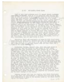
#159 The Elisha Story Place (Coll. 003 Vol. 002 Doc. 090)