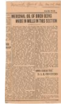
Medicinal Oil of Birch Being Made in Mills in This Section (Coll. 003 Fold. 073 Doc. 030)