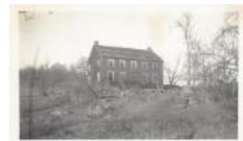
#133 Dwight Main Place (Coll. 003 Vol. 002 Photo 061)