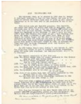
#139 The Hollowell Farm (Coll. 003 Vol. 002)