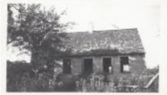
#135 Isham Bromley 1943 (Coll. 003 Vol. 002 Photo 063)