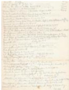
Hewitt information from Preston Vital Records (Coll. 003 Fold. 026 Doc. 002)