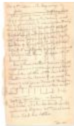
Notes from Edwin Oviatt on the Beginnings of Yale (Coll. 003 Fold. 060 Doc. 009)