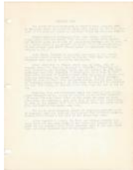
Hezekiah Park (Coll. 003 Vol. 002 Doc. 054)