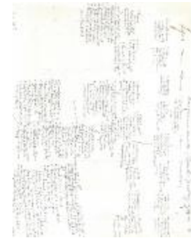
Elder William Brewster Pedigree Chart from Jones (Coll. 003 Fold. 008 Doc. 015)