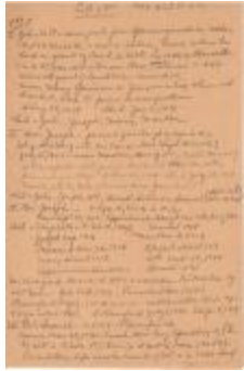
Notes on Coit from Modern History of New London County (Coll. 003 Fold. 073 Doc. 010)