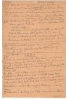
Notes on various families from Modern History of New London County (Coll. 003 Fold. 073 Doc. 011)