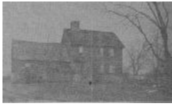
John Dougherty Place was Village Blacksmith's Home (Coll. 001 Fold. 006 Doc. 008)