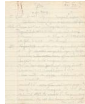
Tyler Genealogy (Genealogy in Otis Library) (Coll. 003 Fold. 048 Doc. 009)