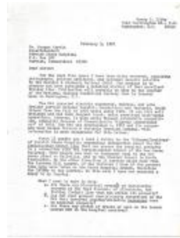
Letter relating to the Norwich and Westerly Railway (Coll. 002 Fold. 032 Doc. 013)