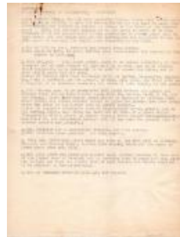
Volume III Colonial Records of Connecticut ---- 1678-1689 (Coll. 003 Fold. 062 Doc. 001)