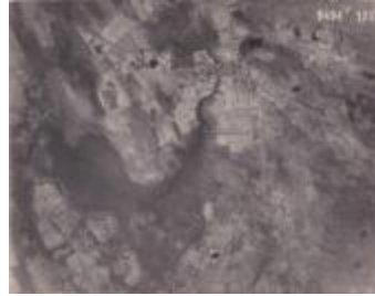
Aerial photo of North Stonington (1934) (Photographs Fold. 003 Photo 065)