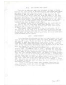
#133 The Dwight Main Place (Coll. 003 Vol. 002 Doc. 059)