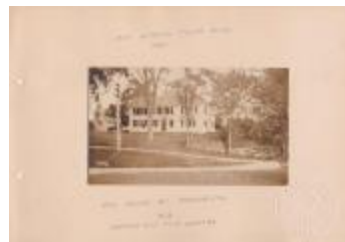
Reverend Lemuel Tyler House, 1800 (Photographs Fold. 008 Photo 158-9)