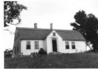
# 137 Silas Park (Coll. 003 Vol. 002 Photo 065)