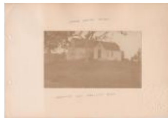
Amos Avery House (Photographs Fold. 008 Photo 158-4)