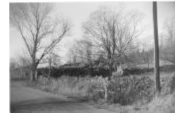
#137 Morrel home (Coll. 003 Vol. 002 Photo 066)