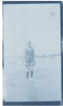
Unidentified woman in a swimsuit (Photographs Fold. 009 Photo 164)