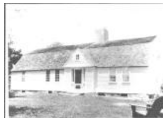
Kimball Homestead (Coll. 003 Vol. 015 Photo 041)