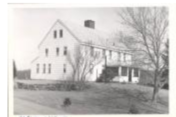
Ebenezer Witter Jr. Home (Coll. 003 Vol. 015 Photo 038)