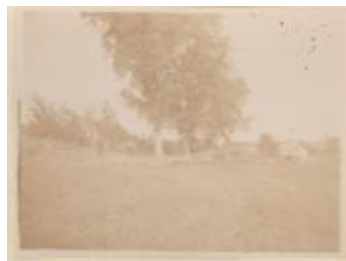
Old Williams Place, Preston, CT. (Photographs Fold. 009 Photo 170)