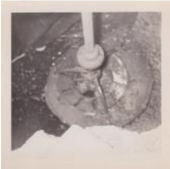
interior view, Lewis Mill (Photographs Fold. 007 Photo 139)