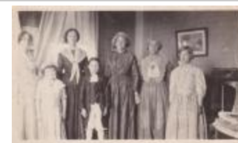
unidentified costumed group (1 February 1978) (Photographs Fold. 007 Photo 153)