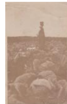
George V. Shedd in cabbage patch (Photographs Fold. 007 Photo 157)