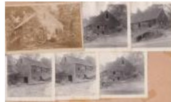
Safford's Mill, Preston, CT (collection of photos) (Photographs Fold. 004 Photo 081)