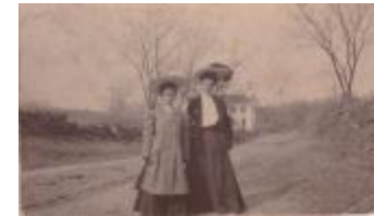
Two unidentified women (Photographs Fold. 004 Photo 086)