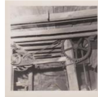
interior view, Lewis Mill (Photographs Fold. 007 Photo 142)