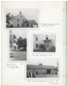
Robert Crary's Home Farm (Coll. 003 Vol. 002 Photo 002)