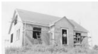
#146A James Wilson 1950 & 1970 (Coll. 003 Vol. 002 Photo 074)