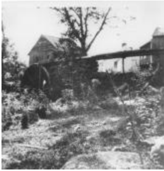
# 130 Paul Park Mill (Coll. 003 Vol. 002 Photo 058)