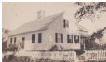
Unidentified house (Photographs Fold. 004 Photo 095)