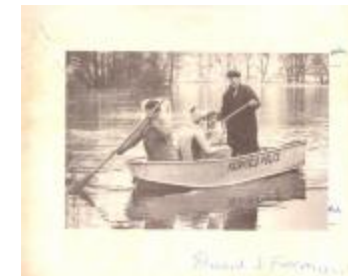
1979 Flood, Halley Avenue, Fairfield (FCN_Floods_1978_1974_1980_1989 (1))