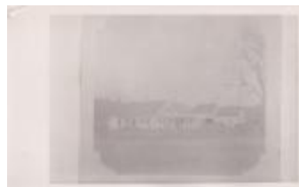
Unidentified house (Photographs Fold. 009 Photo 181)