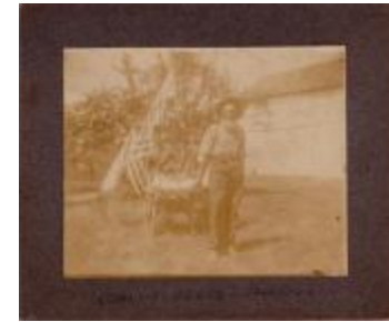
Calob Ellis, Preston (Photographs Fold. 003 Photo 077)