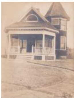
Preston Public Library (Photographs Fold. 004 Photo 098)