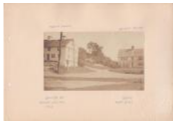
Treat House and Doane House (Photographs Fold. 008 photo 158-3)