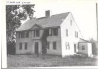
Mott & Downer Home (Coll. 003 Vol. 015 Photo 058)