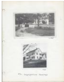
# 72 Congregational Parsonage (Coll. 003 Vol. 002 Photo 003)