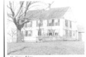
Simeon Fobes Home (Coll. 003 Vol. 015 Photo 025)