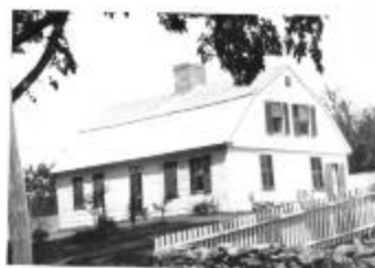
# 100 Stephen Randall Home; Stephen Randall Home (Coll. 003 Vol. 002 Photo 026)