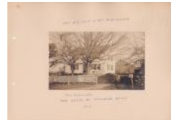
Rev. A.S. Hunt & Rev. E.W. Tucker (Photographs Fold. 008 Photo 158-16)