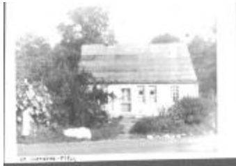
Larrabee-Fitch Home (Coll. 003 Vol. 015 Photo 048)