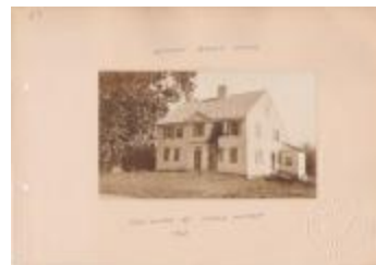
William Brown House (Photographs Fold. 008 Photo 158-5)