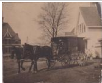
horses & wagon (undated) (Photographs Fold. 007 Photo 148)