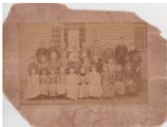
Unidentified school group (Photographs Fold. 004 Photo 088)