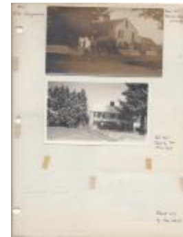
#75 Aldo Gasparino Home (Coll. 003 Vol. 002 Photo 007)