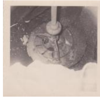
interior view, Lewis Mill (Photographs Fold. 007 Photo 141)