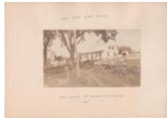
Rev. John Hyde House (Photographs Fold. 008 Photo 158-14)