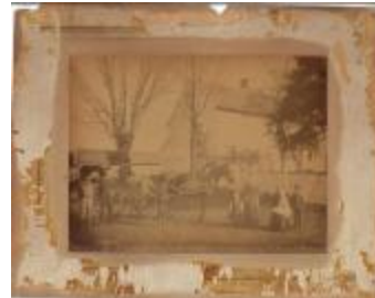
Peckham and Hollowell families (Coll. 001 Fold. 029 Photo 001)

Old Town House Museum Accession Form Accession Number 1978-5-0 Photograph, b & W, 5 x7 of a house built by Dudley Morgan in 1821 (Coll. 001 Fold. 018 Doc. 011)