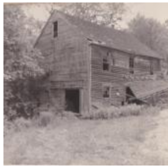
Safford's Mill, Preston, CT. (Photographs Fold. 004 Photo 081-4)