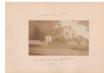
Nathan Hall Home (Photographs Fold. 008 Photo 158-7)