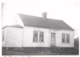
Standish Homestead (Coll. 003 Vol. 015 Photo 057)