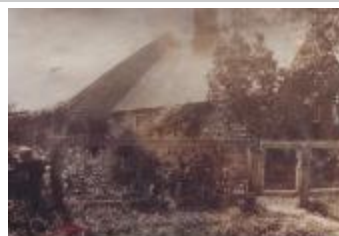
The Henry Stoddard Home- Preston CT about 1893 (Coll. 002 Fold. 018 Photo 003)