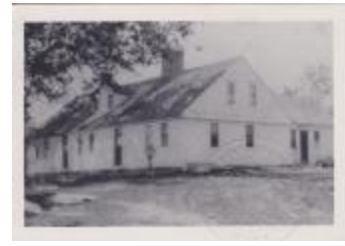
Viola Johnson home (Photographs Fold. 009 Photo 169)