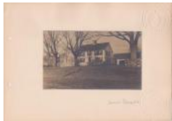
Simeon Fobes house (Photographs Fold. 008 Photo 158-24)