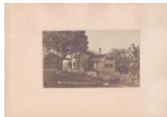
Baptist Parsonage, Preston, Conn. (Photographs Fold. 008 Photo 158-19)