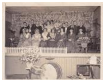
sing-along group chorus (3 February 1978) (Photographs Fold. 007 Photo 155)