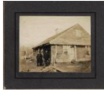
Guile Homestead (Photographs Fold. 001 Photo 021)