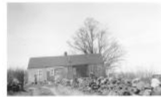
#105A Benjamin Ellal 1954 (Coll. 003 Vol. 002 Photo 033)