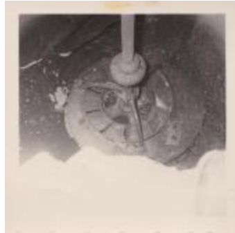
interior view, Lewis Mill (Photographs Fold. 007 Photo 140)