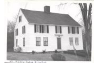
Whipple-Gallup Homestead (Coll. 003 Vol. 015 Photo 064)