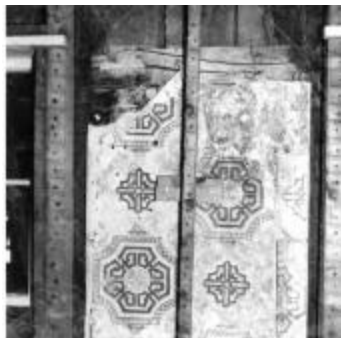
#77 Otis Browning Home (Coll. 003 Vol. 002 Photo 009)