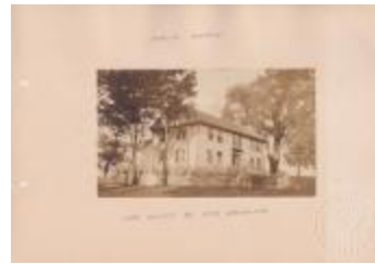
Jacob Meech (Photographs Fold. 008 Photo 158-15)