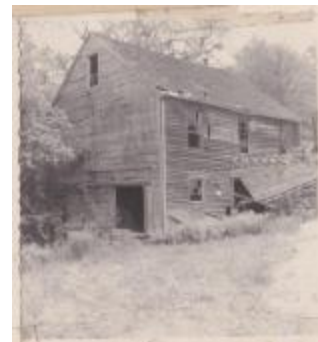
Safford's Mill, Preston, CT. (Photographs Fold. 004 Photo 081-5)