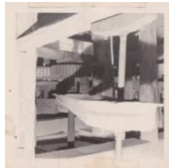
interior view, Lewis Mill (Photographs Fold. 007 Photo 143-2)