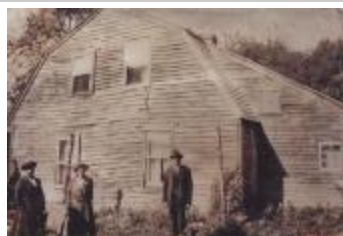
The Henry Stoddard Home - Preston, CT 1893 (Coll. 002 Fold. 018 Photo 002)