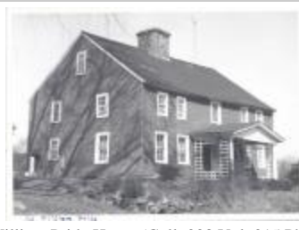
William Pride Home (Coll. 003 Vol. 015 Photo 033)