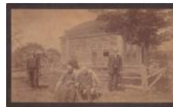
unidentified family and house (Photographs Fold. 003 Photo 072)