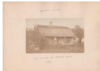
Branch House (Photographs Fold. 008 Photo 158-25)