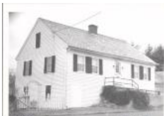
Asa Benjamin Home (Coll. 003 Vol. 015 Photo 034)