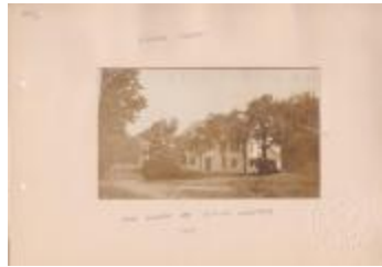
James Treat house (Photographs Fold. 008 Photo 158-1)