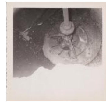
interior view, Lewis Mill (Photographs Fold. 007 Photo 138)