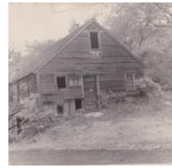
Safford's Mill, Preston, CT. (Photographs Fold. 004 Photo 081-6)