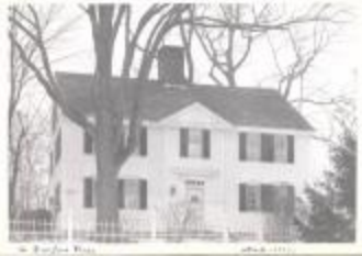
Barstow Place (Coll. 003 Vol. 015 Photo 012)