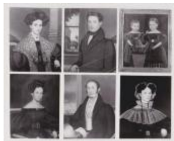
photograph of 6 painted portraits (Photographs Fold. 004 Photo 091)