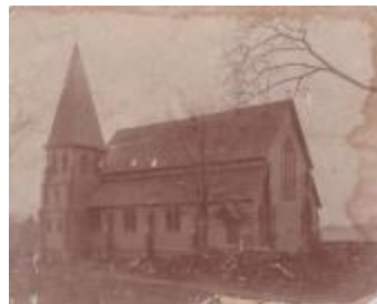
St. James Episcopal Church (exterior) (undated) (Photographs Fold. 007 Photo 145)