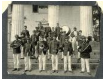
Photograph, Group Photo - Madison Band (2008.133 a b)