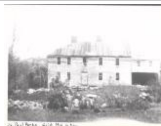
Paul Park's Gristmill and Residence (Coll. 003 Vol. 015 Photo 036)