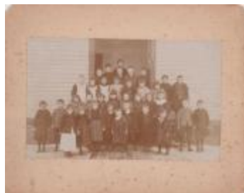
Long Society School group (undated) (Photographs Fold. 007 Photo 134)