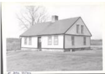
John Killam Home