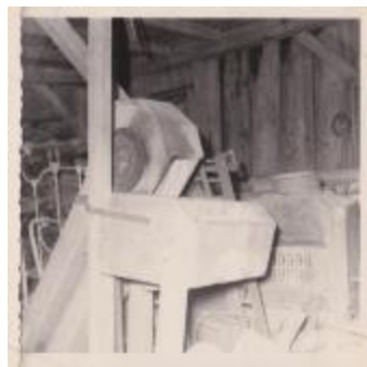
interior view, Lewis Mill (Photographs Fold. 007 Photo 144-3)