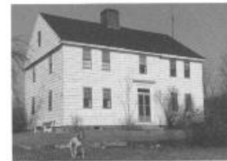
Daniel Morgan Home (Coll. 003 Vol. 015 Photo 023)