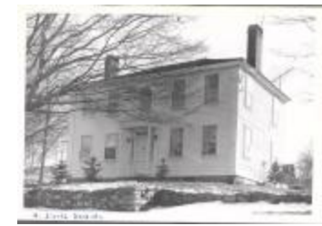
David Baldwin (Coll. 003 Vol. 015 Photo 011)