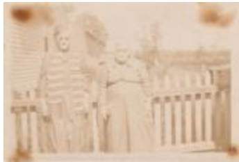
Two unidentified women (Photographs Fold. 004 Photo 083)