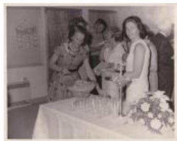
Preston Historical Society group photo (Photographs Fold. 009 Photo 179)