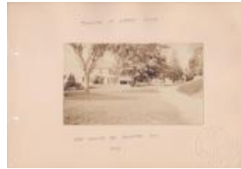
Thomas P. Crary Home (Photographs Fold. 008 Photo 158-11)