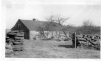
#136 John Woodmansee Red House (Coll. 003 Vol. 002 Photo 064)