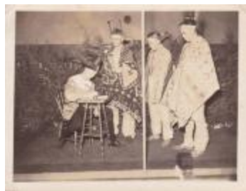
unidentified costumed group (4 February 1978) (Photographs Fold. 007 Photo 154)