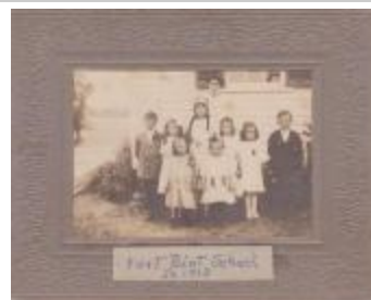
Fort Point School (Photographs Fold. 007 Photo 131)