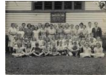
Preston City Congregational Church Sunday School group (Photographs Fold. 001 Photo 031)