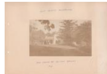
Old Avery Homestead (Photographs Fold. 008 Photo 158-23)