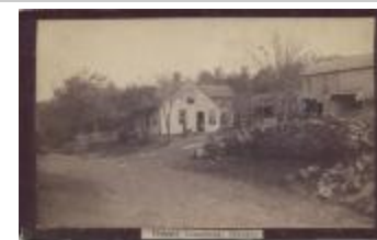
Kimball Homestead, Preston (Coll. 002 Fold. 028 Photo 001)