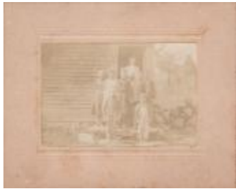
unidentified group (Photographs Fold. 003 Photo 073)