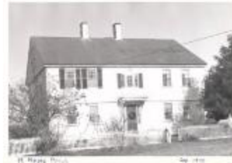
Moses Meech Home (Coll. 003 Vol. 015 Photo 019)