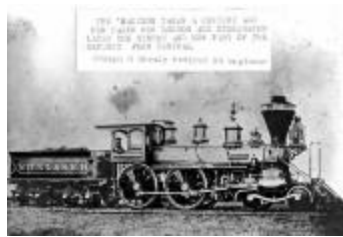
Photo - framed Locomotive image (2020.098.001)