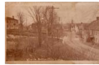
Preston City street scene (circa 1910) (Photographs Fold. 004 Photo 097)