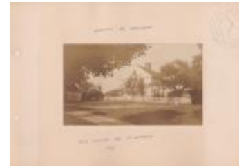
Daniel B. Morgan (Photographs Fold. 008 Photo 158-12)