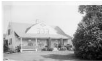
#139 Hollowell Farm (Coll. 003 Vol. 002 Photo 068)