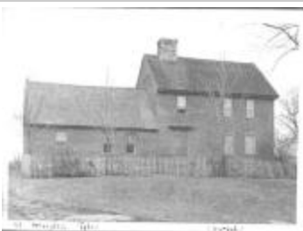
Hopestill Tyler Home (Coll. 003 Vol. 015 Photo 024)