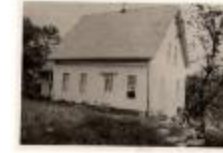
Photograph of Nathaniel S. Brown House, undated (Coll. 003 Fold. 067 Photo 002)