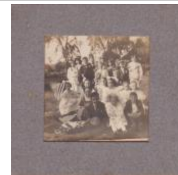
Long Society School group (undated) (Photographs Fold. 007 Photo 133)