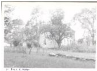
Fred K. Witter home (Coll. 003 Vol. 015 Photo 31)