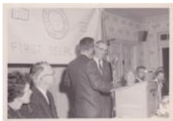
unidentified assembly (Photographs Fold. 007 Photo 135)