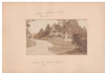
Calvin Barstow House, 1786-90 (Photographs Fold. 008 Photo 158-8)