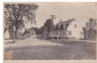
Charles Willett house (Photographs Fold. 004 Photo 092)