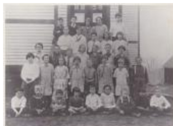
unidentified children group (Photographs Fold. 003 Photo 070-2)