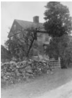
# 146 Percy Drake (Coll. 003 Vol. 002 Photo 073)