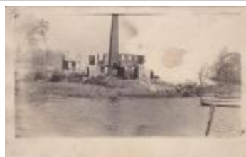
unidentified burned building (Photographs Fold. 007 Photo 147)