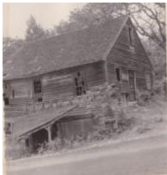
Safford's Mill, Preston, CT. (Photographs Fold. 004 Photo 081-3)