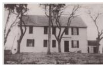
Charles Pendleton place (Amos Lake) (Photographs Fold. 009 Photo 176)