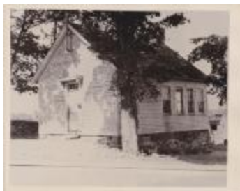
Palmer School (Photographs Fold. 003 Photo 069)