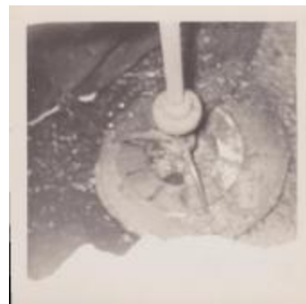
interior view, Lewis Mill (Photographs Fold. 007 Photo 137)