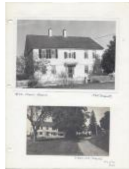
#74 Jesse O. Crary Home (Coll. 003 Vol. 002 Photo 006)