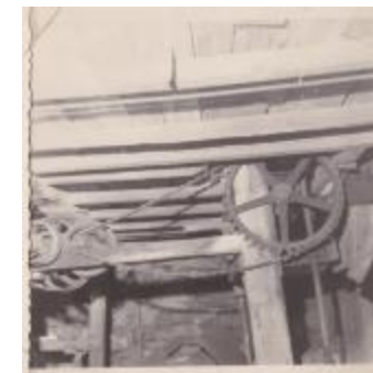
interior view, Lewis Mill (Photographs Fold. 007 Photo 144-5)