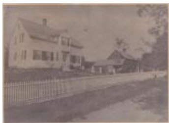
Dudley Morgan house (Photographs Fold. 003 Photo 064)