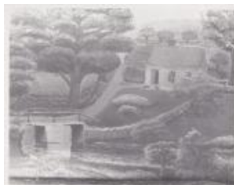
"Broad Brook School" by James E. Burdick (Photographs Fold. 003 Photo 066)