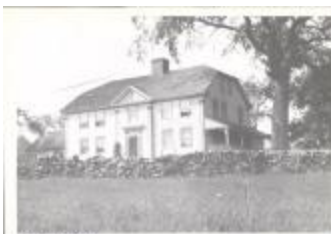
N. Leonard Home (Coll. 003 Vol. 015 Photo 029)