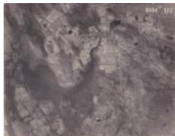
Aerial photo of North Stonington (1934) (Photographs Fold. 003 Photo 065)