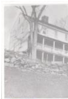
Mathewson's Mill Residence (Coll. 003 Vol. 015 Photo 076)