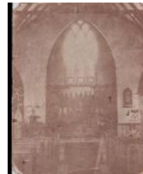
St. James Episcopal Church, Poquetanuck (interior) (undated) (Photographs Fold. 007 Photo 146)