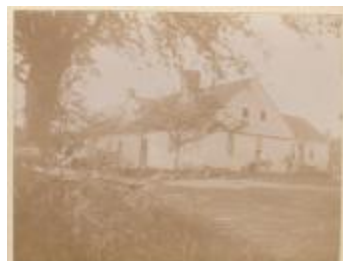
Old Williams Place, Preston, CT (Photographs Fold. 009 Photo 171)