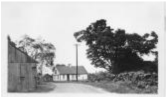
#138 Jephtha Geer home (Coll. 003 Vol. 002 Photo 067)