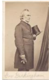
Carte de Visite of Gov. Buckingham (Coll. 003 Fold. 051 Photo 005)