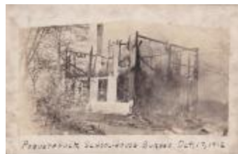
Poquetanuck Schoolhouse (burned 17 Oct 1912) (Photographs Fold. 004 Photo 100)