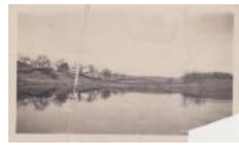
The Old Homestead, Cooktown (Photographs Fold. 009 Photo 182)