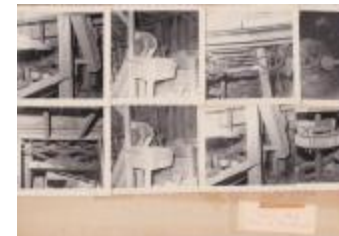
interior views of Lewis's Mill (composite) (Photographs Fold. 007 Photo 144)