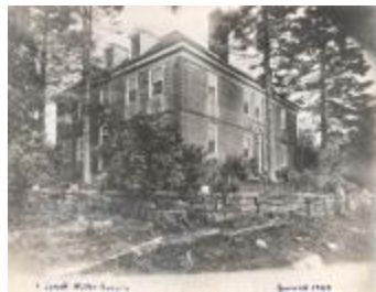
Jonah Witter Mansion (Coll. 003 Vol. 015 Photo 001)