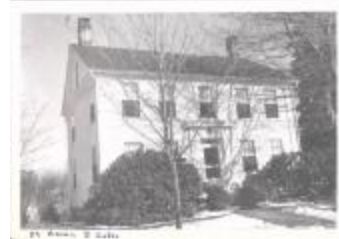
Aaron B. Gates Home (Coll. 003 Vol. 015 Photo 059)