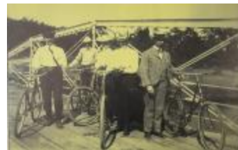
Photograph - Men and Women with Bicycles (E2013.Summer Leisure Exhibit.062)