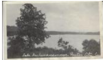
Lake Anchemanconnuc (Amos Lake) (Photographs Fold. 001 Photo 037)