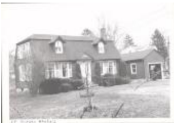
Gurdon Kimball Home (Coll. 003 Vol. 015 065)