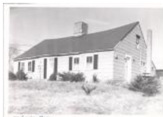
Cyprian Sterry Home (Coll. 003 Vol. 015 Photo 040)