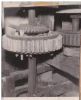
interior view, Lewis Mill (Photographs Fold. 007 Photo 144-8)