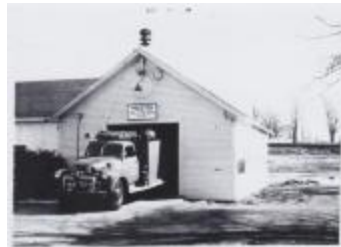
Preston Volunteer Fire Company, District I (Photographs Fold. 003 Photo 080)