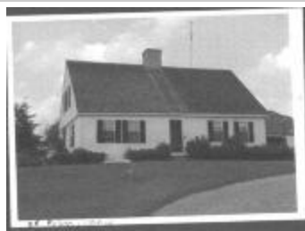
Nathan Fobes Home (Coll. 003 Vol. 015 Photo 028)