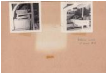
Interior views of Lewis Mill (composite) (Photographs Fold. 007 Photo 143)