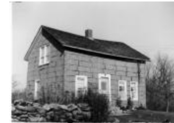
George Bates 1950 (Coll. 003 Vol. 002 Photo 072)