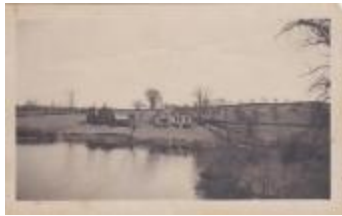
The Old Homestead, Cooktown (Photographs Fold. 009 Photo 183)