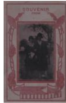
Two unidentified women (Photographs Fold. 003 Photo 075)