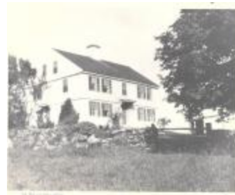
Palmer Homestead (Coll. 003 Vol. 015 Photo 049)