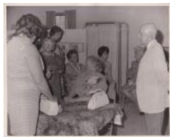
Unidentified Group photo (Photographs Fold. 009 Photo 180)