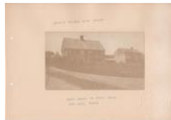
Doane House and Store (Photographs Fold. 008 Photo 158-2)