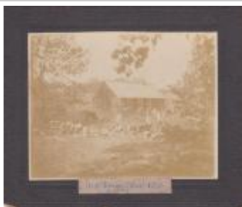
Old Brown School, District #9 (1906) (Photographs Fold. 007 Photo 130)