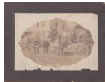
Line crew building first telephone line in Preston (Photographs Fold. 003 Photo 063)