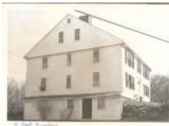
Treat Homestead (Coll. 003 Vol. 015 Photo 015)