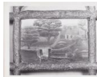
"Broad Brook School" by James E. Burdick framed (Photographs Fold. 003 photo 067)