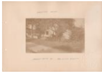
Prentice House (Photographs Fold. 008 Photo 158-13)