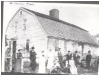
Haskell Place (Coll. 003 Vol. 015 Photo 055)