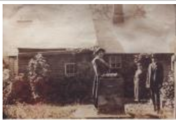
Henry Stoddard Home - Preston, CT - about 1893 (Coll. 002 Fold. 018 Photo 001.)

Unknown Local Girl (Hallville) (Coll. 002 Fold. 012 Photo 012)