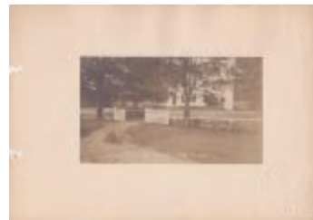
Cong. Parsonage, Preston City, Conn. (Photographs Fold. 008 Photo 158-26)