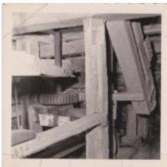
interior view, Lewis Mill (Photographs Fold. 007 Photo 144-1)