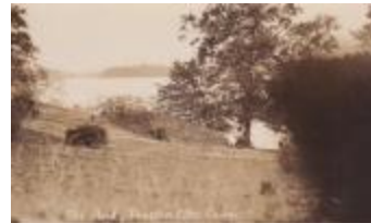
The Pond, Preston City, CT (Photographs Fold. 004 Photo 085)