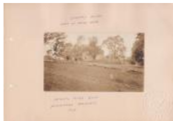
Stanton House west of Amos Lake (Photographs Fold. 008 Photo 158-17)