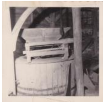
interior view, Lewis Mill (Photographs Fold. 007 Photo 143-1)