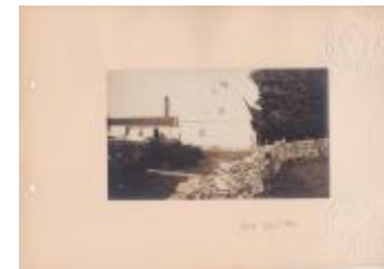
Capt. Elisha Crary (Photographs Fold. 008 Photo 158-27)