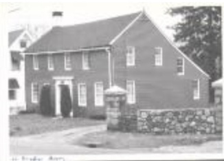
Erastus Avery Home (Coll. 003 Vol. 015 Photo 066)