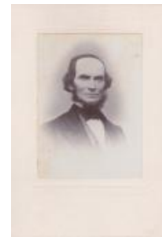
unidentified man (Photographs Fold. 004 Photo 101)