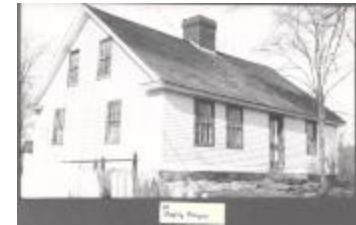
Shapley Morgan Home (Coll. 003 Vol. 015 Photo 051)