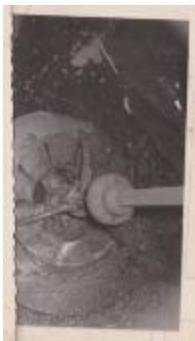
interior view, Lewis Mill (Photographs Fold. 007 Photo 144-7)