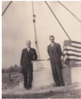
Unidentified building cornerstone dedication (1940) (Photographs Fold. 003 Photo 074)