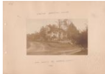
Calvin Barstow House (Photographs Fold. 008 Photo 158-10)