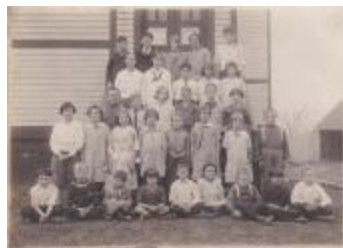
unidentified school group (Photographs Fold. 003 Photo 070-1)