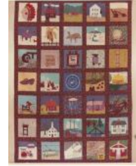
Finished Preston Quilt (Coll. 001 Fold. 008 Photo 003)

May 1st Preston Day celebration brochure, dated 1 May 1976. (Coll. 001 Fold. 015 Doc. 004)