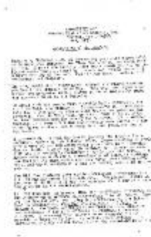
Preston Historical Society Newsletter July 1975 (Coll. 003 Fold. 077 Doc. 026)

May 1st Preston Day celebration brochure, dated 1 May 1976. (Coll. 001 Fold. 015 Doc. 004)