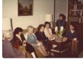
Preston Quilt - Group of participants (Coll. 001 Fold. 008 Photo 001)