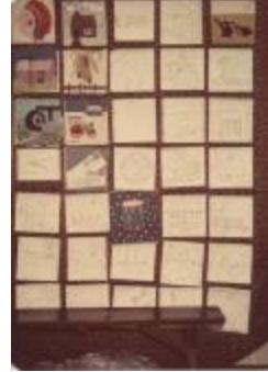
Preston Quilt Plan Layout (Coll. 001 Fold. 008 Photo 002)