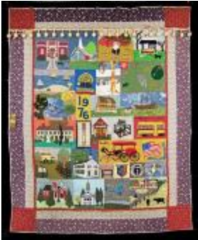
Quilt - Bicentennial quilt for town of Madison (81.409)

Bi-centennial May 1, 1976 Preston, Conn. (Coll. 001 Fold. 008 Doc. 001)