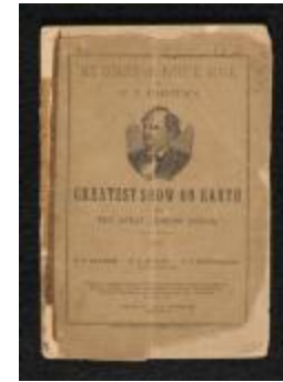
Book: Circus Route Book for 1883 (2003.009.025)