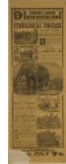
Advertisement: Handbill for "Barnum and London 9 United Monster Shows in Haverhill, July 7" (2003.009.104)