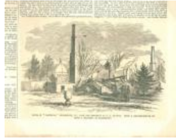
Newspaper: Clipping featuring illustration of "Ruins of Iranistan" (2003.009.076)