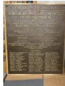
Dedication plaque for the 1976 addition to the Jewish Home (2022.1.25)