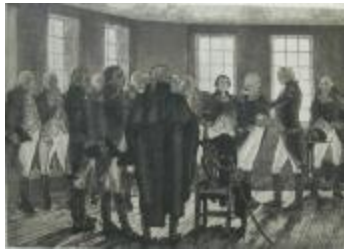
Dramatic Farewell at Fraunces Tavern, from the portfolio, The Bicentennial Pageant of George Washington (1437)