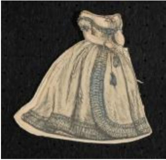
Toys and games: M. Lavinina Warren paper doll, white and blue dress (2003.009.062 F)