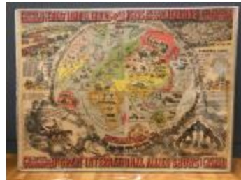
Poster: Great London Circus & Sangers Royal British Menagerie, 1879 (2020.003.001)