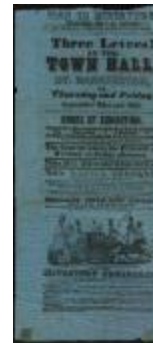
Advertisement: Handbill for "Man in Miniature (General Tom Thumb), arriving in Great Barrington" (2003.009.060)