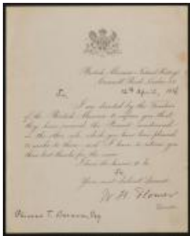
Letter: To P.T. Barnum from W.H. Flower, director of British Museum, April 12, 1886 (2003.009.041)