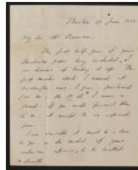
Letter: To P.T. Barnum from Edward Everett, June 27, 1853 (2003.009.039)