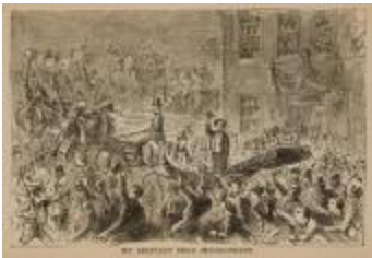
Book: Select illustrations from the book, "Life of Barnum" (2003.009.117)