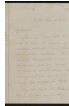
Letter: To P.T. Barnum from O.W. Holmes, December 15, 1853 (2003.009.040)