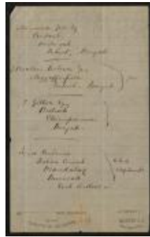
Document: Note written by P.T. Barnum regarding elephants, February 20, 1882 (2003.009.017)