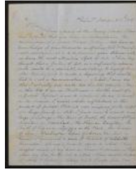
Letter: To P.T. Barnum from Rembrandt Peale, October 25, 1851 (2003.009.077)