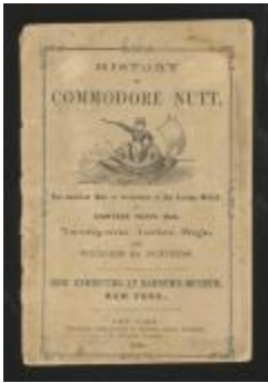
Booklet: "History of Commodore Nutt" (EL 1988.159.001)