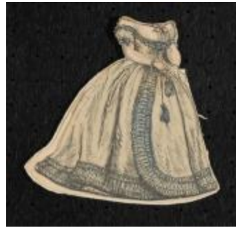
Toys and games: M. Lavinina Warren paper doll, white and blue dress (2003.009.062 F)