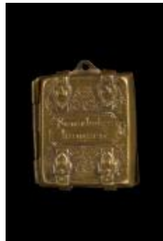
Jewelry: Fairy Wedding souvenir locket (BF 1995.019.001)