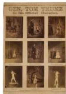
Photograph: "General Tom Thumb in His Different Characters, ca. 1850s" (EL 1988.084.001)