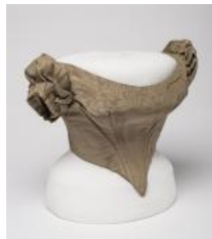
Textile: Bodice belonging to M. Lavinia Warren (T 2015.001.001)