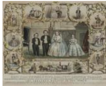
Print: "The Fairy Wedding" of General Tom Thumb (Charles S. Stratton) by Currier and Ives (T 2016.048.001)