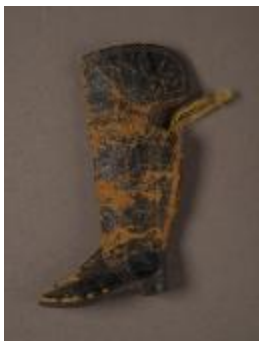
Textile: Miniature tall boot belonging to Charles S. Stratton (EL 1988.119.001)