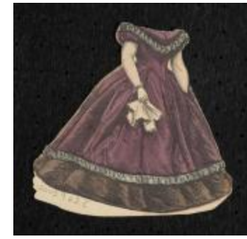
Toys and games: M. Lavinia Warren paper doll, burgundy dress (2003.009.062 C)