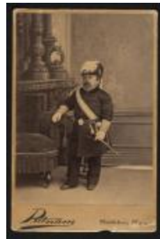
Photograph: Charles S. Stratton in Masonic uniform (owned by the Barnum Museum) (2003.009.069)