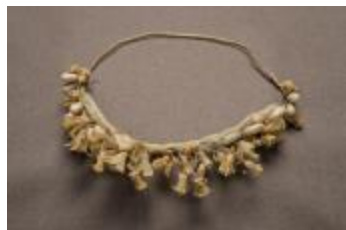
Textile: Bridal headpiece belonging to M. Lavinia Warren (T 2017.004.001)