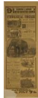
Advertisement: Handbill for "Barnum and London 9 United Monster Shows in Haverhill, July 7" (2003.009.104)