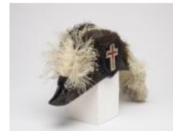
Textile: Masonic uniform hat belonging to Charles S. Stratton (2014.007.001 E)