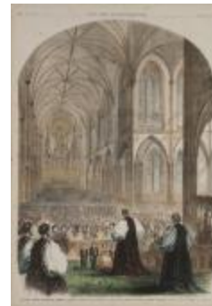
Newspaper: "The Fairy Wedding - The Marriage Ceremony of Charles S. Stratton (Gen. Tom Thumb) and Miss Lavinia Warren (the Queen of