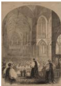
Newspaper: "The Fairy Wedding - The Marriage Ceremony of Charles S. Stratton (Gen. Tom Thumb) and Miss Lavinia Warren (The Queen of