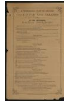
Document: Phrenology chart for M. Lavinia Warren, 1871 (MS 0003.117.001)