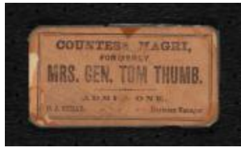
Ticket: "Countess Magri formerly Mrs. Gen. Tom Thumb" (EL 1988.276.001 AB)