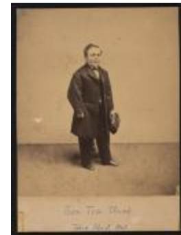
Photograph: Charles S. Stratton, full length portrait against plain background (EL 1989.184.001)