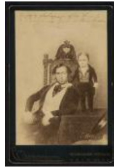
Photograph: Charles S. Stratton and his Father, Sherwood Stratton (EL 1988.251.001)