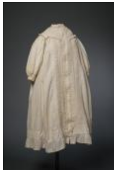
Textile: Nightgown belonging to M. Lavinia Warren (1976.001.008)