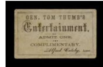
Ticket: "Gen. Tom Thumb's Entertainment" (EL 1988.266.001)