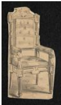
Toys and games: M. Lavinina Warren paper doll, arm chair (2003.009.062 I)