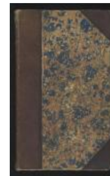
Book: "Tom Thumb's Three Years Tour Around the World" (inscribed copy) (EL 1988.087.001)