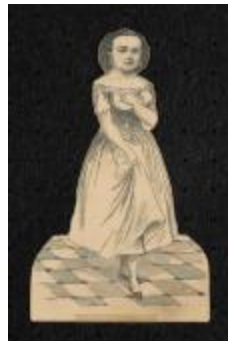
Toys and games: M. Lavinia Warren paper doll, figure in undergarments (2003.009.062 A)