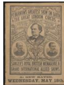
Courier: Advance Courier of Barnum's Greatest Show on Earth and the Great London Circus for May 18, 1881 (T 2015.055.001)