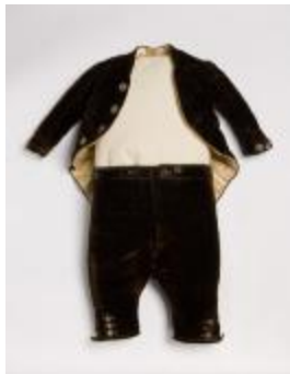
Textile: Charles S. Stratton's Court Suit, 1844 (T 2008.005.001 AB)