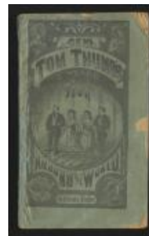
Book: "Tom Thumb's Three Years Tour Around the World" (front and back covers only) (EL 1988.086.001)