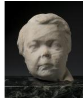
Sculpture: Cemetery monument of Charles S. Stratton's head, 1857 (1972.004.001)