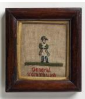
Textile: Needlework embroidered picture of "General Tom Thumb" (2012.003.001)