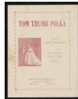
Sheet Music: "Tom Thumb Polka" with a "History of Mr. and Mrs. Tom Thumb" (EL 1988.153.001)