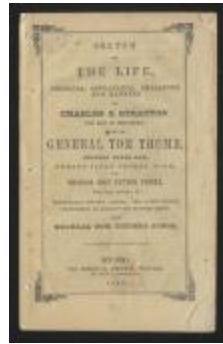
Book: "Sketch of the Life, Personal Appearance, Character and Manners of Charles S. Stratton" (EL 1988.160.001)