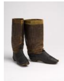
Textiles: Miniature boots belonging to Charles S. Stratton (EL 1988.117.001 AB)