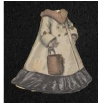
Toys and games: M. Lavinina Warren paper doll, winter coat with fur collar and muff (2003.009.062 G)