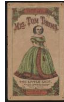
Toys and games: M. Lavinia Warren paper doll set (partial) with two dresses (EL 1988.106.001)