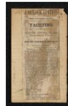
Newspaper: Article "Yachting" from Brooklyn Eagle listing Capt. Stratton (General Tom Thumb) (T 2016.019.001)