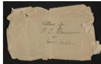
Letter: Letter from P.T. Barnum to George Washington Morrison Nutt, undated (envelope only) (BM-MSS 002 S01 B01F08)