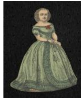
Toys and games: M. Lavinia Warren paper doll, figure wearing green dress (2003.009.062 B)