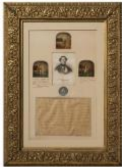
Framed items: P. T. Barnum's Tom Thumb Memorial Archive (T 2016.037.001)