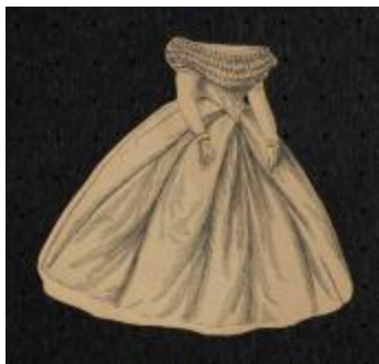
Toys and games: M. Lavinia Warren paper doll dresses in white and pink (EL 1988.107.001)