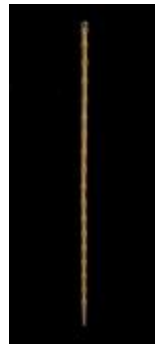
Equipment: Miniature walking stick belonging to Charles S. Stratton (General Tom Thumb) (BF 1997.019.005)