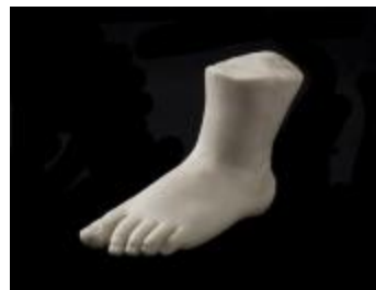
Sculpture: Replica Foot of Charles S. Stratton (Gen. Tom Thumb) (EL 1988.122.1)