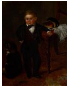
Painting: "Portrait of Charles Sherwood Stratton with a Dog" (1936.005.001)