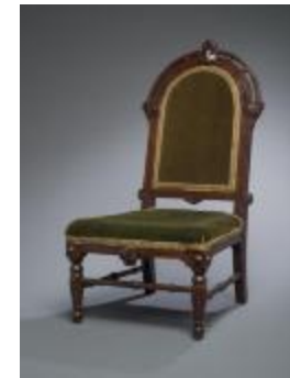
Furniture: Chair belonging to Charles S. Stratton (EL 1988.052.001)