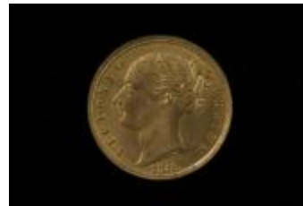
Physical object: Brass token with Queen Victoria and Charles S. Stratton (2000.007.001)