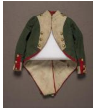
Textile: Napoleon costume jacket belonging to Charles S. Stratton (2017.004.001)