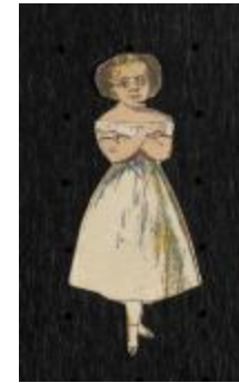
Toys and games: Minnie Warren paper doll, figure in undergarments (2003.009.062 H)