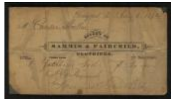
Document: Receipt to Charles S. Stratton from Sammis & Fairchild Clothiers, 1872 (EL 1988.277.001)