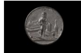
Souvenir: Token featuring Charles S. Stratton (Gen. Tom Thumb), his chariot on reverse (T 2017.002.001)