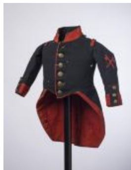
Textile: Military style jacket belonging to Charles S. Stratton (2014.006.001)