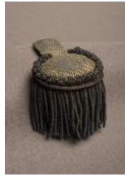
Textile: Miniature Epaulet worn by Charles S. Stratton (Gen. Tom Thumb) (1936.006.001)