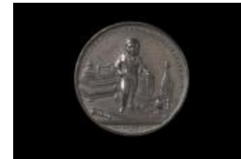
Physical object: Token featuring Charles S. Stratton (Gen. Tom Thumb), his history on reverse (2004.005.011)