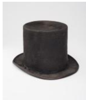
Textile: Miniature top hat belonging to Charles S. Stratton (EL 1988.111.001)