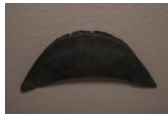
Textile: Bicorne hat belonging to Charles S. Stratton (EL 1988.126.001)