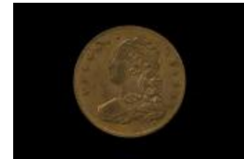
Physical object: Brass token with Lady Liberty and General Tom Thumb (2000.007.003)