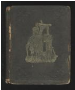
Book: "Life and Travels of Thomas Thumb in the United States, England, France, and Belgium with Illustrations of Him in His Different