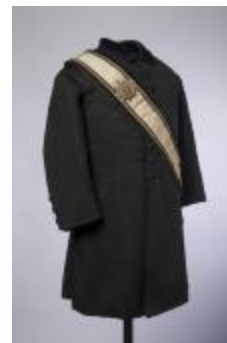
Textile: Masonic uniform jacket and accessories belonging to Charles S. Stratton (2014.007.001 AD)