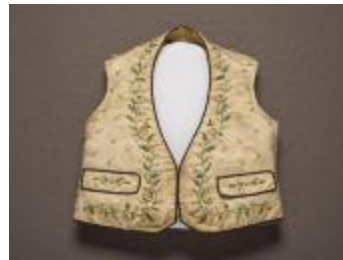
Textile: Miniature embroidered silk vest belonging to Charles S. Stratton (1976.001.099)