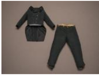
Textile: Black wool suit belonging to Charles S. Stratton (General Tom Thumb) (1888.002.001 AB)