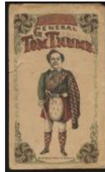
Toys and games: General Tom Thumb paper doll set (partial) (EL 1988.105.001)