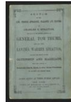
Book: "Sketch of the Life of General Tom Thumb and Lavinia Warren Stratton", 1867 (covers only) (T 2014.033.001)