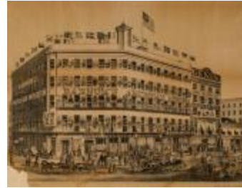
Print: "Barnum's American Museum" (T 2012.001.001)