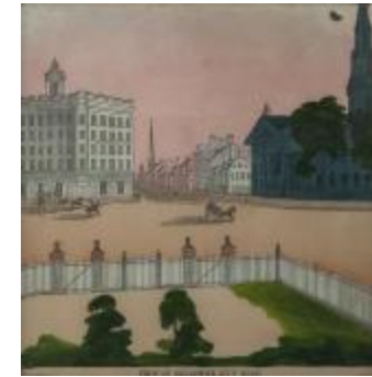
Physical object: Clock component, Painted glass panel from mantel clock, "View in Broadway, New York" (2015.009.001)