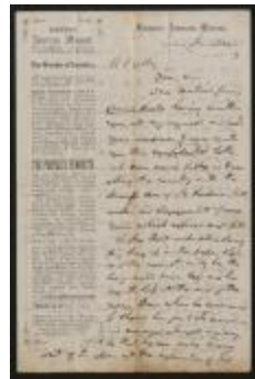
Letter: To B.P. Cilley from P.T. Barnum, March 26, 1861 (BM-MSS 002 S01 B01F04)