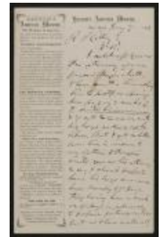
Letter: To B.P. Cilley from P.T. Barnum, January 7, 1862 (BM-MSS 002 S01 B01F04)