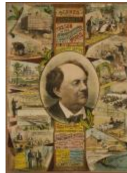
Poster: P. T. Barnum's "Scenes from a Long and Busy Life" poster (EL 1988.042.001)