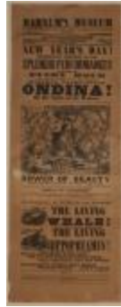
Advertisement: Broadside "Barnum's Museum on New Year's Day, 1862" (EL 1990.001.003)