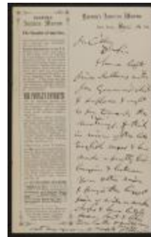
Letter: To B.P. Cilley from P.T. Barnum, December 14, 1861 (BM-MSS 002 S01 B01F04)