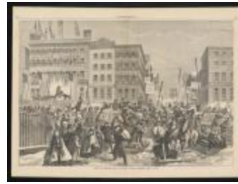
Newspaper: Centerfold of Harper's Weekly, "View of Broadway, Opposite Fulton Street, New York," with Barnum's American Museum in the background, Feb. 1860 (2015.008.001)