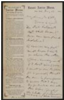
Letter: B.P. Cilley from P.T. Barnum, [?] 16, 1862 (BM-MSS 002 S01 B01F04)