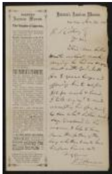
Letter: To B.P. Cilley from P.T. Barnum, November 20, 1861 (BM-MSS 002 S01 B01F04)