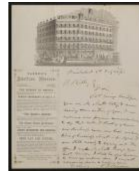
Letter: To B. P. Cilley from P.T. Barnum, July 22, 1861 (BM-MSS 002 S01 B01F04)