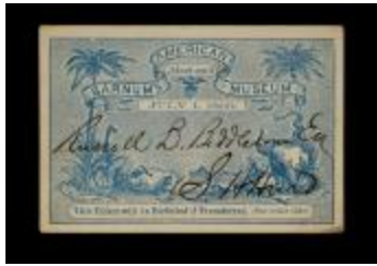
Ticket: Ticket to Barnum's American Museum (2001.004.001)