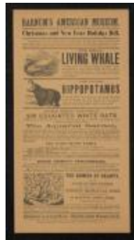
Advertisement: Handbill for "Barnum's American Museum, Christmas and New Year Holiday Bill" (T 2014.024.001)