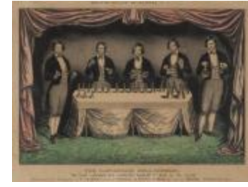
Print: "The Lancashire Bell Ringers," No. 4 in Barnum's Gallery of Wonders by Currier and Ives" (T 2013.037.001)