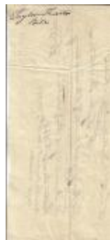
Payment to Taylor Thurston front (Coll. 002 Fold. 004 Doc. 036)