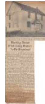
Meeting House with Long History to be Repaired (Coll. 001 Fold. 003 Doc. 018)

Preston Thanksgiving (Coll. 001 Fold. 002 Doc. 029)