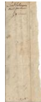
Saml Tallman Bill for lime (Coll. 002 Fold. 004 Doc. 025)