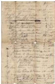
Third Meetinghouse Subscriptions (Coll. 002 Fold. 004 Doc. 022)