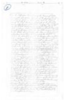
Photocopy of Timothy Swan Bond (Coll. 002 Fold. 008 Doc. 006)