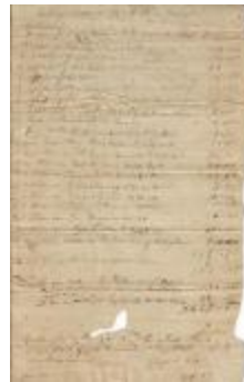
Bill of Articles for Meeting House (Coll. 002 Fold. 004 Doc. 019)