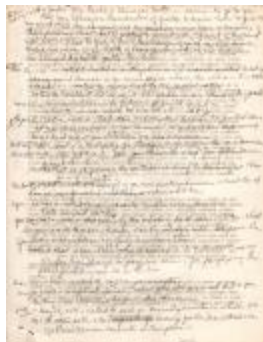
A Book of Record for the First Church in Preston Transcripts pg. 14 (Coll. 003 Fold. 061 Doc. 014)