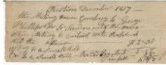
Meeting House Company Bill (Coll. 002 Fold. 004 Doc. 013)