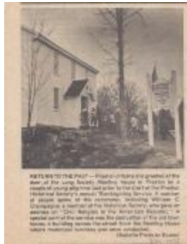
Return to the Past (Coll. 002 Fold. 022 Doc. 008)