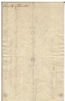
Society (Thurston front) (Coll. 002 Fold. 004 Doc. 035)