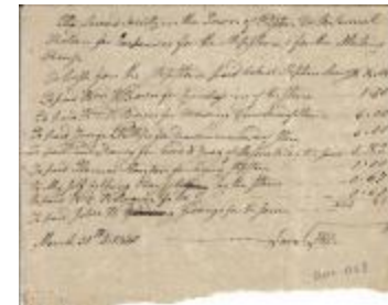
Meeting House expenses (Coll. 002 Fold. 004 Doc. 033)