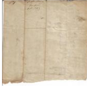
Unpaid Subscriptions (Coll. 002 Fold. 004 Doc. 028)