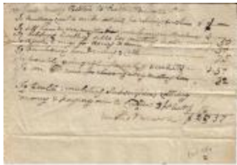
Erastus Brewster bill (Coll. 002 Fold. 004 Doc. 016)