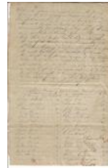
First Meeting House Subscriptions (Coll. 002 Fold. 004 Doc. 021)