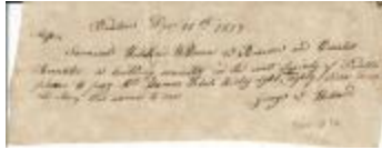
Order for Thomas Fitch (Coll. 002 Fold. 004 Doc. 012)