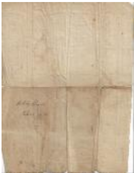
Meeting House bills (Coll. 002 Fold. 004 Doc. 030)