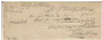
Long Society note for 300 planks (Coll. 002 Fold. 004 Doc. 001)

Letter from Archibald MacLeish (Coll. 001 Fold. 014 Doc. 002)