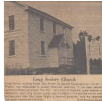
Long Society Church Rededicated Sunday (Coll. 001 Fold. 003 Doc. 022)

Interest in Long Society Church has been Revived (Coll. 001 Fold. 003 Doc. 021)