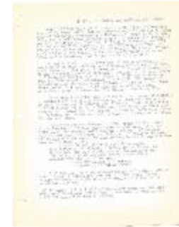
#113 Long Society and Long Society Church (Coll. 003 Vol. 002 Doc. 044)