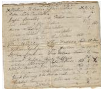
Subscriptions for Repairing Meeting house (Coll. 002 Fold. 004 Doc. 017)