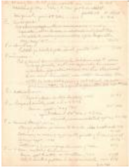
M. Hall's Notes from col. VI of Preston City Congregational Church Records (Coll. 003 Fold. 063 Doc. 025)