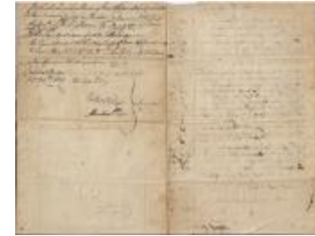
Report on Meetinghouse accts. (Coll. 002 Fold. 004 Doc. 029)