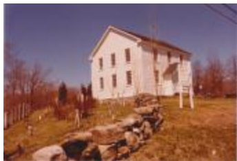
Long Society Church (Photographs Fold. 005 Photo 103)