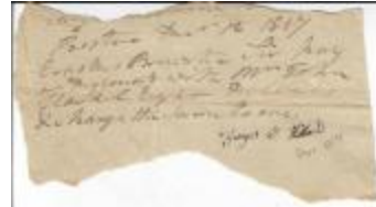
Order to pay from George Willard (Coll. 002 Fold. 004 Doc. 014)