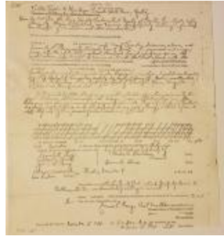
Photocopy of quit claim deed for Long Town house and land 1936 (Coll. 002 Fold. 009 Doc. 021)