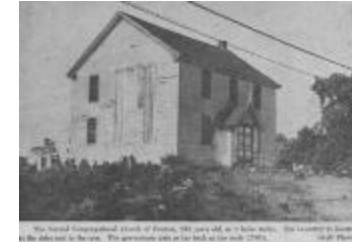
228-Yr.-Old Second Congregational Church in Preston City Stands Empty (Coll. 001 Fold. 004 Doc. 005)

Restored Church's Dedication Slated (Coll. 001 Fold. 003 Doc. 062)