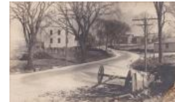
Long Society Meetinghouse and Road (Photographs Fold. 004 Photo 084)