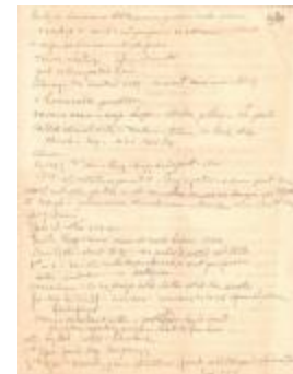
M. Hall Notes on Early Meeting Houses (Coll. 003 Fold. 063 Doc. 023)