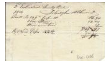
Bill for Meetinghouse (Coll. 002 Fold. 004 Doc. 038)