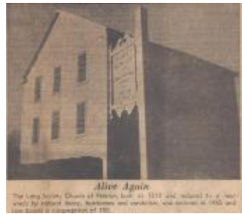
Tale of Long Society (Coll. 001 Fold. 003 Doc. 020)

Interest in Long Society Church has been Revived (Coll. 001 Fold. 003 Doc. 021)