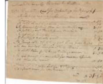
Samuel Holden bill (Coll. 002 Fold. 004 Doc. 015)