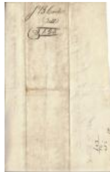
J.B. Clark bill (Coll. 002 Fold. 004 Doc. 031)