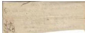
Thomas Stanton bill (Coll. 002 Fold. 004 Doc. 004)