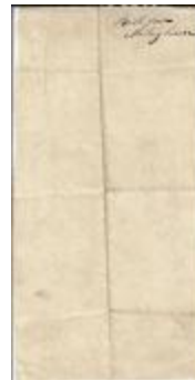
1834 bill for Meeting House (Coll. 002 Fold. 004 Doc. 032)