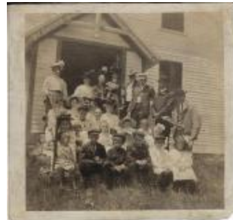
Sunday morning services at Long Society Church (circa 1910) (Photographs Fold. 002 Photo 052)