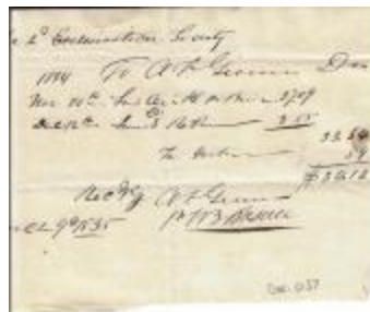
Payment to Russell (Coll. 002 Fold. 004 Doc. 037)