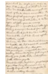
M. Hall's Notes on Congregational Church History pg. 6 (Coll. 003 Fold. 063 Doc. 006)