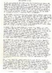
Baptist Church information (Coll. 003 Fold 054 Doc. 005)