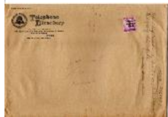
Rebuilding Long Society Church - 1817 & old papers (Coll. 003 Fold. 068 Doc. 001)