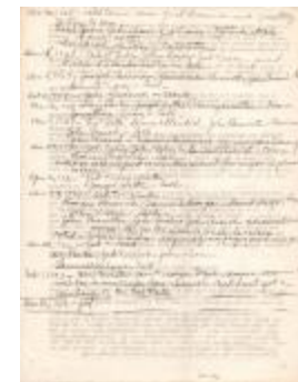
A Book of Record for the First Church in Preston Transcripts pg. 13 (Coll. 003 Fold. 061 Doc. 013)