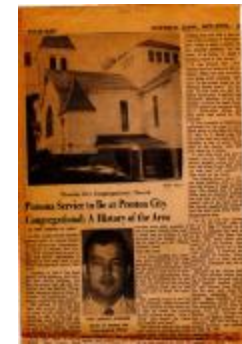
Pomona Service to Be at Preston City Congregational; A History of the Area (Coll. 003 Fold. 063 Doc. 022)