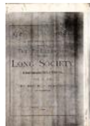
Copy of A Historic Discourse delivered at The Re-Dedication of the Long Society or Second Congregational Church, Preston, Conn. (Coll. 003 Fold. 068 Doc. 002)