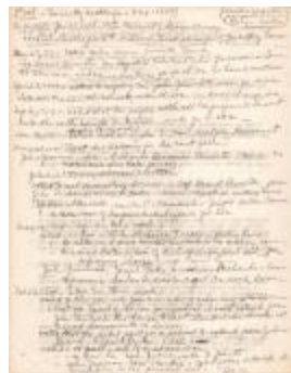
A Book of Record for the First Church in Preston Transcripts pg. 11 (Coll. 003 Fold. 061 Doc. 011)