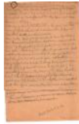
Venerable Soc. for the Propagation of the Gospel in Foreign Parts (Coll. 003 Fold. 060 Doc. 012)