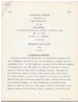
A Historical Discourse Delivered at The Re-Dedication of the Long Society, or Second Congregational Church, of Preston, Conn. (Coll.