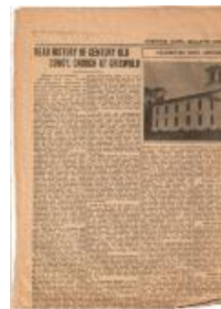
Read History of Century Old Cong'l Church at Griswold (Coll. 003 Fold. 073 Doc. 035)