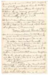
M. Hall's Notes on Congregational Church History pg. 9 (Coll. 003 Fold. 063 Doc. 009)