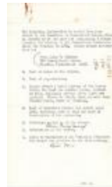
Preston City Congregational Church Response to Committee on Connecticut Congregational History - November 1965 (Coll. 003 Fold. 063)