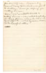
M. Hall's Notes on Congregational Church History pg. 12 (Coll. 003 Fold. 063 Doc. 012)