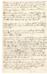
M. Hall's Notes on Congregational Church History pg. 10 (Coll. 003 Fold. 063 Doc. 010)