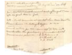
M. Hall's Notes on 20th Century Congregational Church History Fragment (Coll. 003 Fold. 063 Doc. 014)