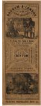
Advertisement: Handbill for "Barnum & London 10 Greatest Shows on Earth" (1992.033.001)