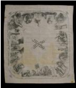
Textile: Large Handkerchief featuring story of Jumbo the Elephant (2005.003.001)