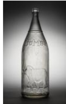
Food T & E: Glass bottle featuring Jumbo (BF 1992.002.001)