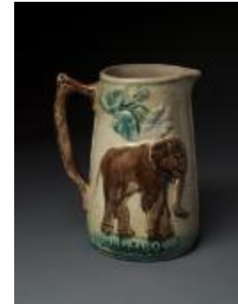
Food Service: Pitcher featuring Jumbo the elephant (EL 1989.007.001)