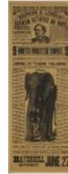
Advertisement: Handbill for "Barnum & London, Barnum Returns No More", June 27 (2003.009.105)