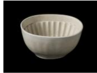
Food service: Ironstone pudding mold with elephant (EL 1989.006.001)