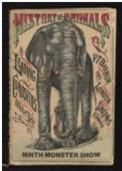
Booklet: "History of Animals and Leading Curiosities . . ." featuring Jumbo on cover (T 2014.045.001)