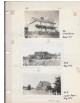
#87 Lot K. Brown, 87A Biber, 87B Pierce (Coll. 003 Vol. 002 Photo 014)