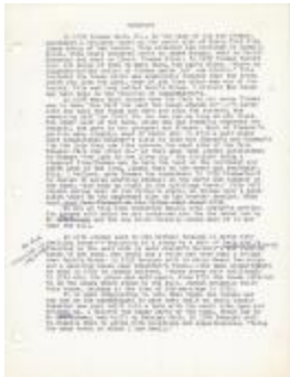
Cooktown (Coll. 003 Vol. 002 Doc. 076)