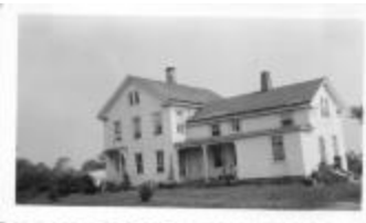
#142 Joseph LoPresti 1950 (Coll. 003 Vol. 002 Photo 070)