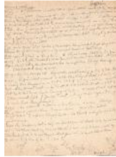
Benjamin Property notes (Coll. 003 Fold. 006 Doc. 006)