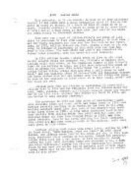
# 120 Walter Krohn (Coll. 003 Vol. 002 Doc. 048)