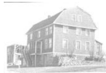
Merchant Wight Home (Coll. 003 Vol. 015 Photo 072)