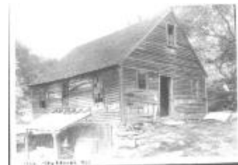
Stafford's Mill (Coll. 003 Vol. 015 Photo 43b)