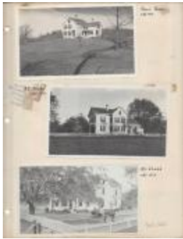
Frank Robbins home 1910 (Coll. 003 Vol. 002 Photo 025)