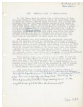
#105 George E. Bates land (Coll. 003 Vol. 002 Doc. 034)