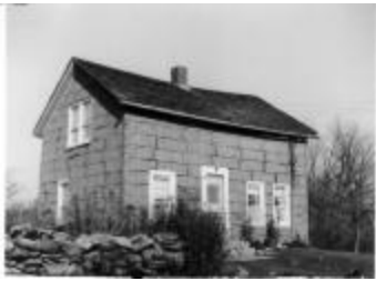
George Bates 1950 (Coll. 003 Vol. 002 Photo 072)