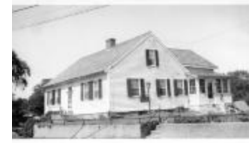
#119 Fitch-Peckham Homestead (Coll. 003 Vol. 002 Photo 047)