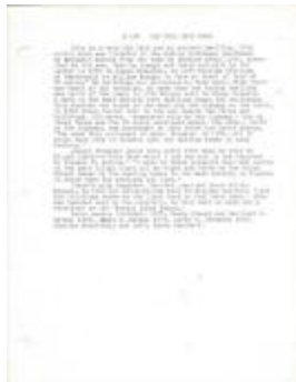
#114 The Toll Gate Farm (Coll. 003 Vol. 002 Doc. 045)