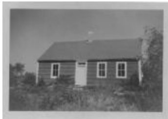
#80 Arthur Park 1953 (Coll. 003 Vol. 002 Photo 010)