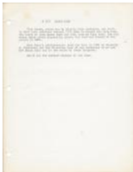
#128 Amasa Main (Coll. 003 Vol. 002 Doc. 052)