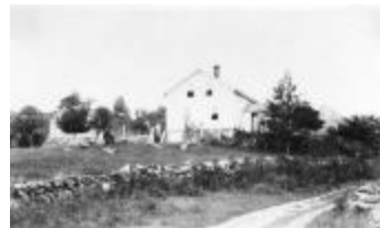
#161 Albert Richmond Place (Coll. 003 Vol. 002 Photo 080)