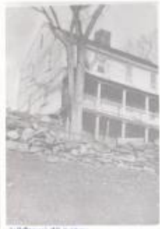
Mathewson's Mill Residence (Coll. 003 Vol. 015 Photo 076)