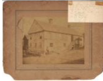
Home of James Hyde Fitch (Coll. 001 Fold. 030 Photo 001)