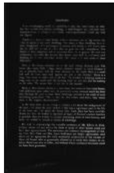
Introduction (Photographs Fold. 010 Photo 18)