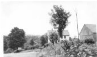
#128 Amasa Main home 1946 (Coll. 003 Vol. 002 Photo 057)