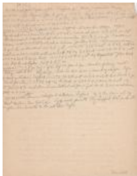
Safford land records for 1724, 1753, and 1785 (Coll. 003 Fold. 038 Doc. 005)