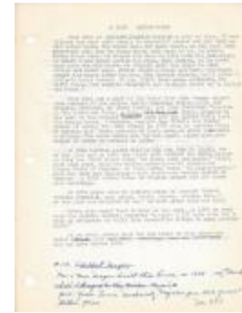
#110 A Arthur McGee (Coll. 003 Vol. 002 Doc. 042)