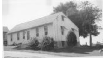
#124 Philip Harvey Home 1952 (Coll. 003 Vol. 002 Photo 053)