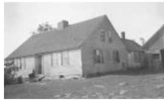
#166 The Frink Place (Coll. 003 Vol. 002 Photo 084)