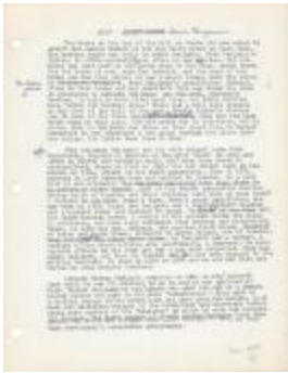
#107 Edwin Benjamin (Coll. 003 Vol. 002 Doc. 039)