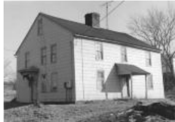
#114 Toll Gate Farm 1952 (Coll. 003 Vol. 002 Photo 044)