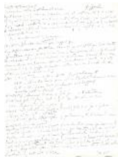
1694-1798 Safford land information taken from Preston Land Records (Coll. 003 Fold. 038 Doc. 008)