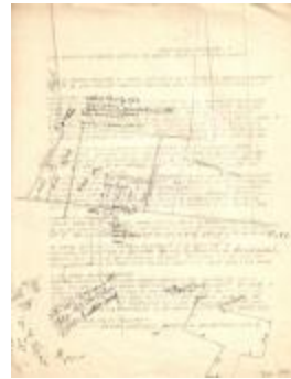
Diagram of property off of School House Rd., Preston (Coll. 003 Fold. 075 Doc. 006)