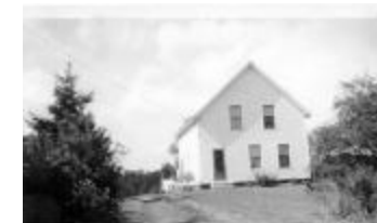
#111 Rose MacAvoy home 1952 (Coll. 003 Vol. 002 Photo 042)