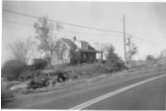
#112 G. Kleeman 1954 (Coll. 003 Vol. 002 Photo 043)