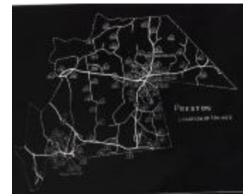
Location of Homes (Photographs Fold. 010 Photo 18)