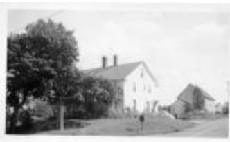
#108 Capt. Moses Hillard 1952 (Coll. 003 Vol. 002 Photo 038)