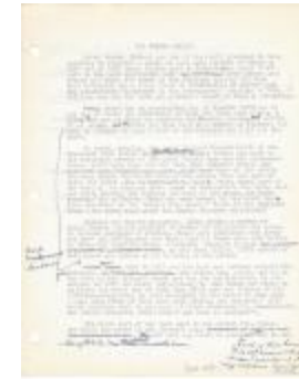
The Forbes Family (Coll. 003 Vol. 002 Doc. 017)