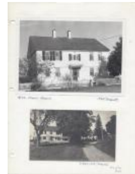
#74 Jesse O. Crary Home (Coll. 003 Vol. 002 Photo 006)