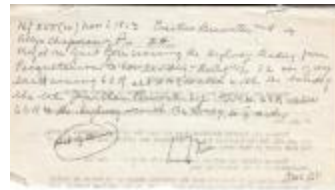
Notes on Erastus Brewster 2nd and Allyn Chapman property (Coll. 003 Fold. 075 Doc. 011)