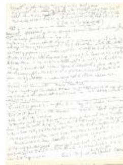
Coll. 003 Fold. 041 Doc. 006 Standish land deed info (Coll. 003 Fold. 041 Doc. 006)