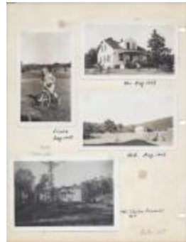
#86 A,B, Abrahamson (Coll. 003 Vol. 002 Photo 013)