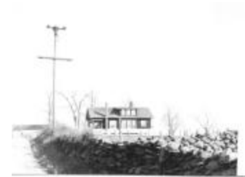
#143 Charles Pendleton 1956 (Coll. 003 Vol. 002 Photo 071)