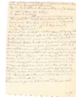
Standish land information 1800s (Coll. 003 Fold. 041 Doc. 008)