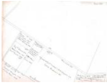
Poquetanuck land ownership @ late 16th century on (Coll. 003 Fold. 075 Doc. 004)