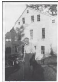
Punderson Home (Coll. 003 Vol. 015 Photo 071)