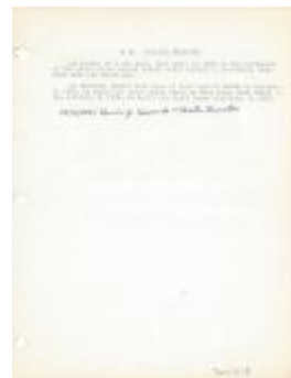
#91 Chester Thurston (Coll. 003 Vol. 002 Doc. 018)