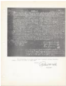
Fobes - Plymouth Colony Deed 1649 (Coll. 003 Vol. 002 Photo 033)