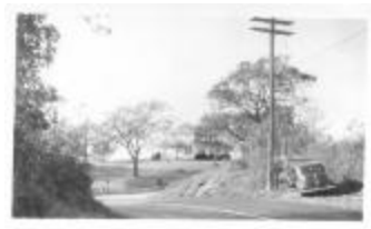
#110 Adelbert Magee 1946 (Coll. 003 Vol. 002 Photo 040)