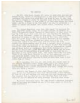
The Meeches (Coll. 003 Vol. 002 Doc. 005)