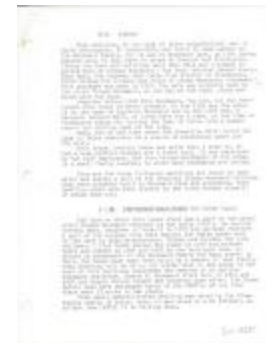
# 132 Florak (Coll. 003 Vol. 002 Doc. 058)