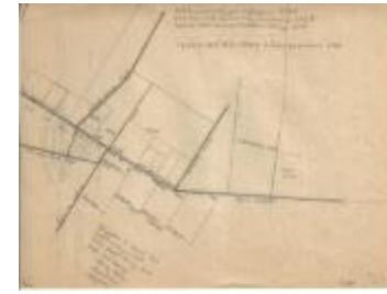
Diagram of Poquetanuck property ownership before 1800 (Coll. 003 Fold. 075 Doc. 007)