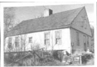
Stafford's Mill Residence (Coll. 003 Vol. 015 Photo 043)