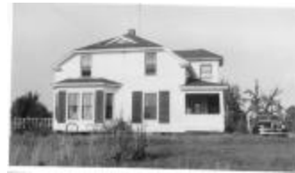
#153 Laprade Oct. 1952 from S (Coll. 003 Vol. 002 Photo 077)