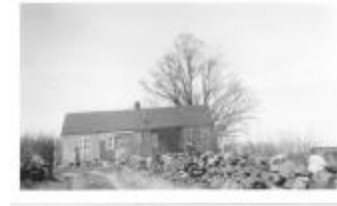
#105A Benjamin Ellal 1954 (Coll. 003 Vol. 002 Photo 033)