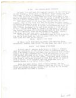
#122 The Charles Miner Property (Coll. 003 Vol. 002 Doc. 050)