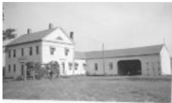
#156 Luther Place 1941 (Coll. 003 Vol. 002 Photo 079)