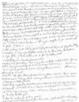
Preston land records 1715-1770 (Coll. 003 Fold. 075 Doc. 016)