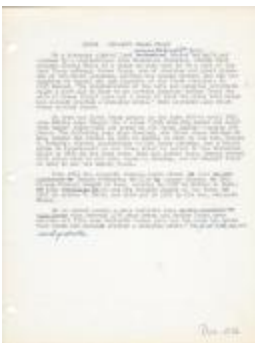
#105A Benjamin Ellal Place (Coll. 003 Vol. 002 Doc. 036)