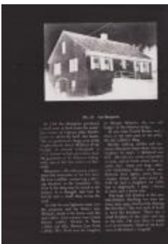
Asa Benjamin (Photographs Fold. 010 Photo 18.34)