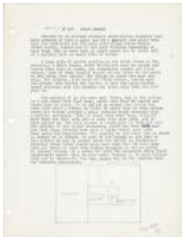
#157 & #158 Isaac Dawley (Coll. 003 Vol. 002 Doc. 089)