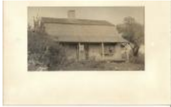
Reproduction of photo of Raymond Camps Home - Branch Hill (Coll. 001 Fold. 028 Photo 001)