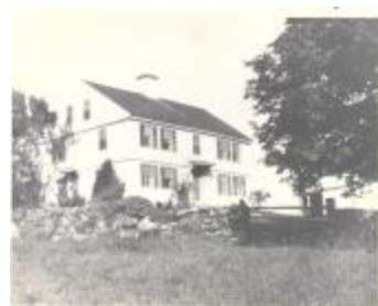
Palmer Homestead (Coll. 003 Vol. 015 Photo 049)