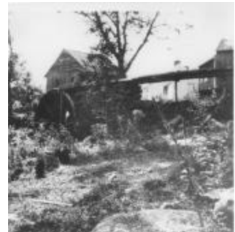
#130 Paul Park Mill (Coll. 003 Vol. 002 Photo 058)