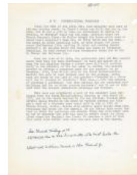
#72 Congregational Parsonage (Coll. 003 Vol. 002 Doc. 003)