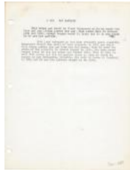
# 153 Ray LaPrade (Coll. 003 Vol. 002 Doc. 085)