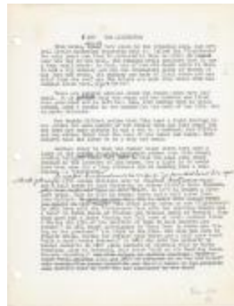
#169 The Lighthouse (Coll. 003 Vol. 002 Doc. 104)