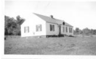
#103B Leonard Chapman Home (Coll. 003 Vol. 002 Photo 030)