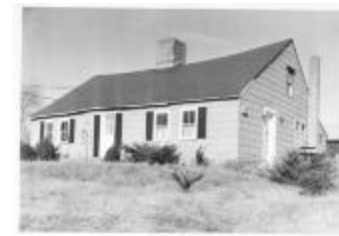
#154 Cyprian Sterry (Coll. 003 Vol. 002 Photo 078)