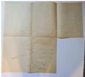
#367 Capt. Williams Property (Coll. 003 Fold. 075 Doc. 008)