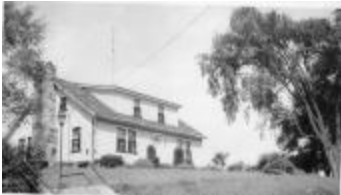
#120 Walter Krohn 1952 (Coll. 003 Vol. 002 Photo 048)