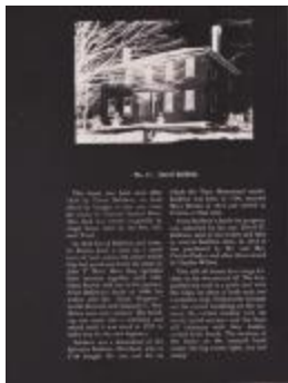
David Baldwin (Photographs Fold. 010)