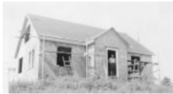
#146A James Wilson 1950 & 1970 (Coll. 003 Vol. 002 Photo 074)