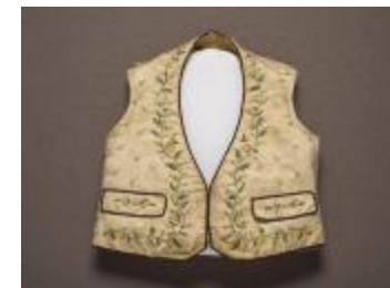
Textile: Miniature embroidered silk vest belonging to Charles S. Stratton (1976.001.099)