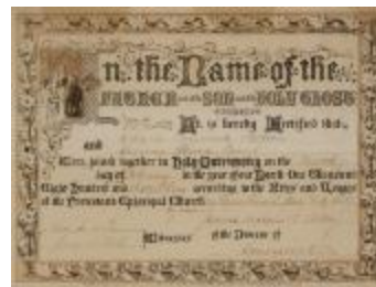
Document: "Marriage Certificate of Charles Stratton (General Tom Thumb) to Mercy Lavinia Warren Bump (Lavinia Warren)" (T 2013.036.001)