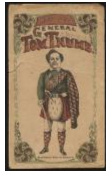
Toys and games: General Tom Thumb paper doll set (partial) (EL 1988.105.001)