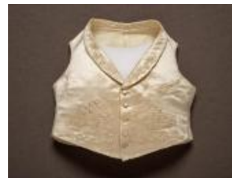
Textile: Wedding vest belonging to Charles S. Stratton (1976.001.096)