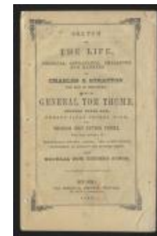
Book: "Sketch of the Life, Personal Appearance, Character and Manners of Charles S. Stratton" (EL 1988.160.001)