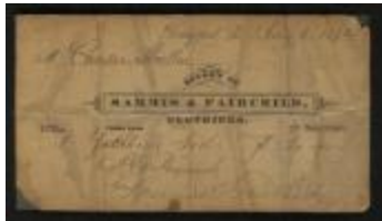
Document: Receipt to Charles S. Stratton from Sammis & Fairchild Clothiers, 1872 (EL 1988.277.001)