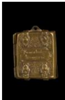
Jewelry: Fairy Wedding souvenir locket (BF 1995.019.001)