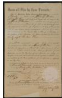
Document: Cemetery plot purchase by Charles S. Stratton, 1864 (MS 0003.102.001)