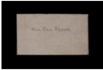
Calling Card: Calling card for "Gen. Tom Thumb" (T 2016.028.001)