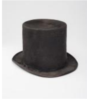
Textile: Miniature top hat belonging to Charles S. Stratton (EL 1988.111.001)