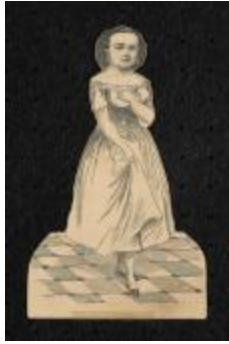
Toys and games: M. Lavinina Warren paper doll, figure in undergarments (2003.009.062 A)