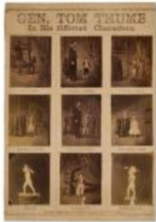
Photograph: "General Tom Thumb in His Different Characters, ca. 1850s" (EL 1988.084.001)