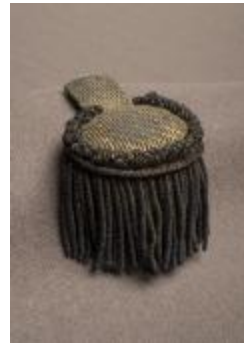
Textile: Miniature Epaulet worn by Charles S. Stratton (Gen. Tom Thumb) (1936.006.001)