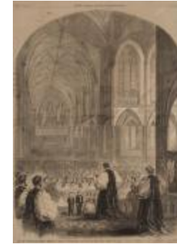
Newspaper: "The Fairy Wedding - The Marriage Ceremony of Charles S. Stratton (Gen. Tom Thumb) and Miss Lavinia Warren (The Queen of