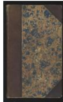
Book: "Tom Thumb's Three Years Tour Around the World" (inscribed copy) (EL 1988.087.001)