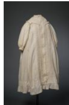
Textile: Nightgown belonging to M. Lavinia Warren (1976.001.008)