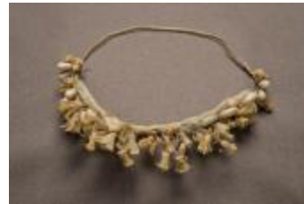
Textile: Bridal headpiece belonging to M. Lavinia Warren (T 2017.004.001)