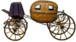
Transportation T & E: Miniature Carriage for Commodore Nutt (George Washington Morrison Nutt) (1976.001.132 )