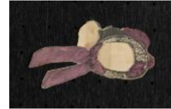
Toys and games: M. Lavinina Warren paper doll, burgundy bonnet (2003.009.062 D)