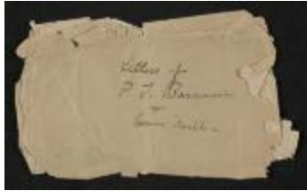
Letter: Letter from P.T. Barnum to George Washington Morrison Nutt, undated (envelope only) (BM-MSS 002 S01 B01F08)