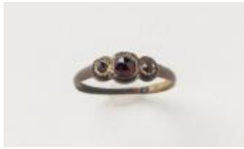
Jewelry: Garnet ring belonging to Charles S. Stratton (EL 1988.182.003)