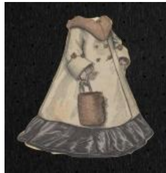
Toys and games: M. Lavinina Warren paper doll, winter coat with fur collar and muff (2003.009.062 G)