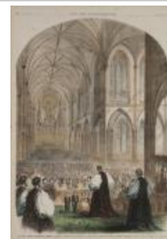
Newspaper: "The Fairy Wedding - The Marriage Ceremony of Charles S. Stratton (Gen. Tom Thumb) and Miss Lavinia Warren (the Queen of