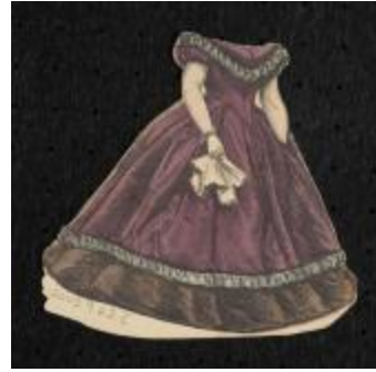
Toys and games: M. Lavinina Warren paper doll, burgundy dress (2003.009.062 C)