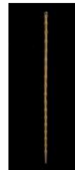
Equipment: Miniature walking stick belonging to Charles S. Stratton (General Tom Thumb) (BF 1997.019.005)