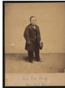
Photograph: Charles S. Stratton, full length portrait against plain background (EL 1989.184.001)