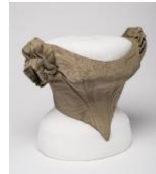
Textile: Bodice belonging to M. Lavinia Warren (T 2015.001.001)