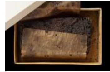
Souvenir: Boxed slice of Mr. and Mrs. Gen. Tom Thumb's wedding cake (2000.004.001 AC)