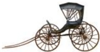
Transportation T & E: Pony phaeton carriage owned by Charles S. Stratton and M. Lavinia Warren (1976.001.094)