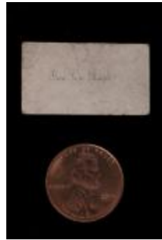
Calling Card: Calling card for "Gen. Tom Thumb" (1977.003.001)