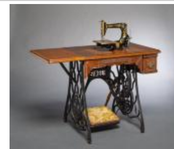
Textile equipment: Sewing machine owned by M. Lavinia Warren (2018.009.001)