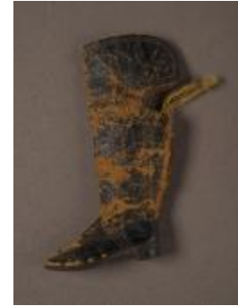
Textile: Miniature tall boot belonging to Charles S. Stratton (EL 1988.119.001)