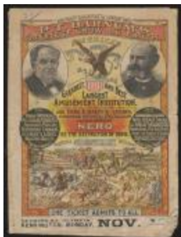
Courier: P.T. Barnum's Greatest Show on Earth in London, November 11, 1889 (T 2016.023.001)