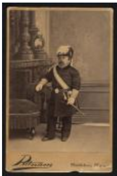
Photograph: Charles S. Stratton in Masonic uniform (owned by the Barnum Museum) (2003.009.069)