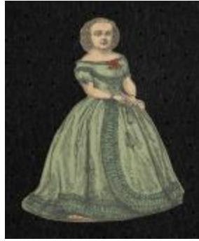
Toys and games: M. Lavinina Warren paper doll, figure wearing green dress (2003.009.062 B)