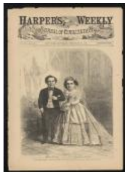
Newspaper: Cover and article from Harper's Weekly for February 21, 1863, featuring the Fairy Wedding (BF 1990.009.001-005)