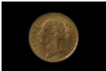
Physical object: Brass token with Queen Victoria and Charles S. Stratton (2000.007.001)