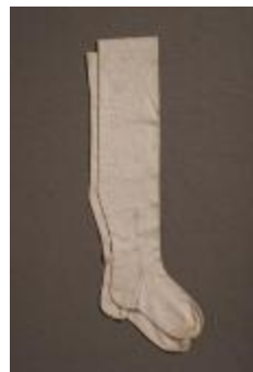
Textile: Pair of stockings belonging to M. Lavinia Warren (EL 1988.158.001 AB)