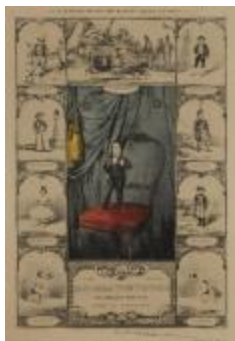
Print: "General Tom Thumb as he appeared before Her Majesty Queen Victoria" by Currier & Ives (owned by the Barnum Museum) (T