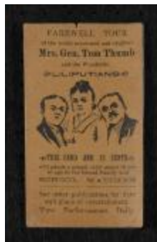
Ticket: Ticket for the Farewell Tour of Mrs. Gen. Tom Thumb and the Wonderful Liliputians (T 2016.025.001)