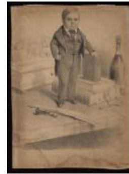
Print: "Charles S. Stratton, known as General Tom Thumb" by Charles Baugniet (T 2016.046.001)