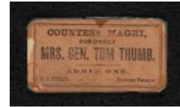
Ticket: "Countess Magri formerly Mrs. Gen. Tom Thumb" (EL 1988.276.001 AB)