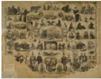
Poster: "Barnum's American Museum, Performance Three Times Daily, [Sun]rise till 10" (T 2014.025.001)