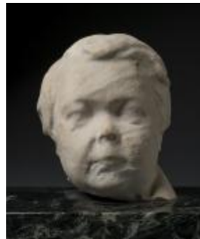
Sculpture: Cemetery monument of Charles S. Stratton's head, 1857 (1972.004.001)