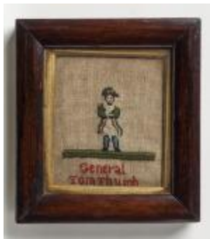
Textile: Needlework embroidered picture of "General Tom Thumb" (2012.003.001)