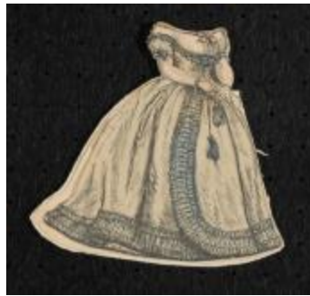
Toys and games: M. Lavinina Warren paper doll, white and blue dress (2003.009.062 F)