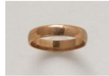
Jewelry: Lavinia Warren's Wedding Ring (1981.004.008)