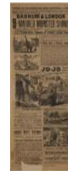
Advertisement: Handbill for "Barnum & London 9-Married Monster Shows" (2003.009.106)