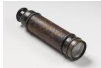
Transportation T & E: Nautical spyglass owned by Charles S. Stratton (EL 1988.129.001)