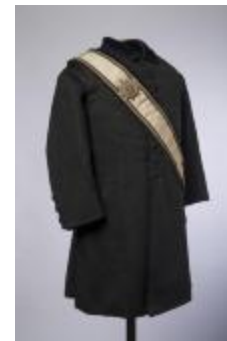
Textile: Masonic uniform jacket and accessories belonging to Charles S. Stratton (2014.007.001 AD)