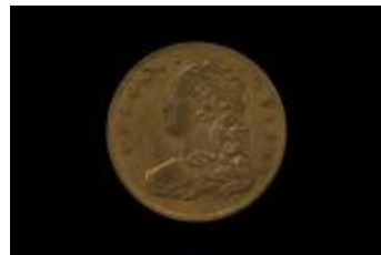
Physical object: Brass token with Lady Liberty and General Tom Thumb (2000.007.003)