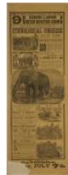
Advertisement: Handbill for "Barnum and London 9 United Monster Shows in Haverhill, July 7" (2003.009.104)