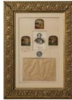
Framed items: P. T. Barnum's Tom Thumb Memorial Archive (T 2016.037.001)