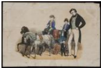
Print: Charles S. Stratton (General Tom Thumb) next to his miniature carriage (T 2015.059.001)