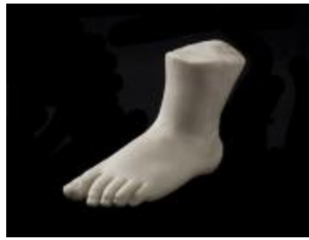
Sculpture: Replica Foot of Charles S. Stratton (Gen. Tom Thumb) (EL 1988.122.1)