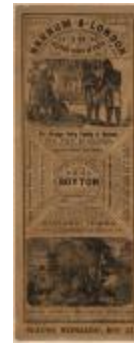
Advertisement: Handbill for "Barnum & London 10 Greatest Shows on Earth" (1992.033.001)