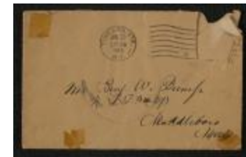
Letter: My dear brother and sister Edith from Sister Vinnie (M. Lavinia Warren), June 20, 1915 (MS 0003.106.002)