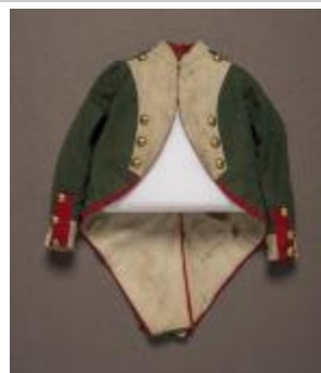
Textile: Napoleon costume jacket belonging to Charles S. Stratton (2017.004.001)