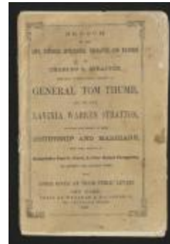
Book: "Sketch of the Life of General Tom Thumb and Lavinia Warren Stratton", 1867 (covers only) (T 2014.034.001)