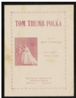
Sheet Music: "Tom Thumb Polka" with a "History of Mr. and Mrs. Tom Thumb" (EL 1988.153.001)