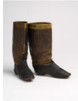
Textiles: Miniature boots belonging to Charles S. Stratton (EL 1988.117.001 AB)