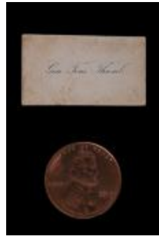
Calling Card: Calling card for "Gen. Tom Thumb" (T 2016.029.001)