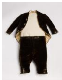
Textile: Charles S. Stratton's Court Suit, 1844 (T 2008.005.001 AB)