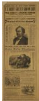
Advertisement: Handbill for "P.T. Barnum's Greatest Show on Earth, The Great London Circus, and Sanger's Royal British Menagerie 7