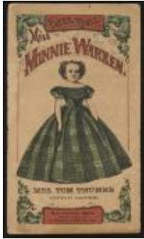
Toys and games: Minnie Warren paper doll set (EL 1988.107.001)