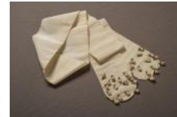
Textile: Dress sash belonging to Minnie Warren (T 2017.005.001)