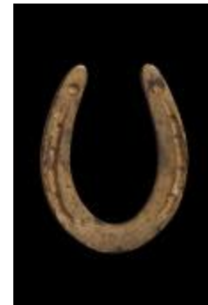
Transportation T & E: Horseshoe belonging to one of Charles S. Stratton's ponies (EL 1988.141.001)