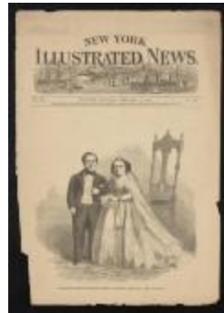
Newspaper: Cover illustration of New York Illustrated, featuring the Fairy Wedding, February 21, 1863 (1982.019.001)