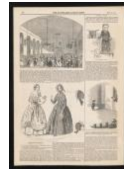
Newspaper: Article from Illustrated London News, February 24, 1844, about Charles S. Stratton's (General Tom Thumb) performance (T 2016.021.001)