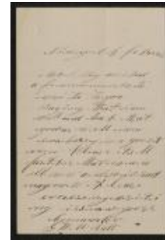
Letter: To Tilly? from George Washington Morrison Nutt, February 4, 1862 (MS 0002.209.001)