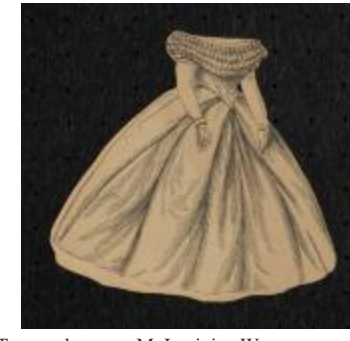
Toys and games: M. Lavinia Warren paper doll dresses in white and pink (EL 1988.107.001)