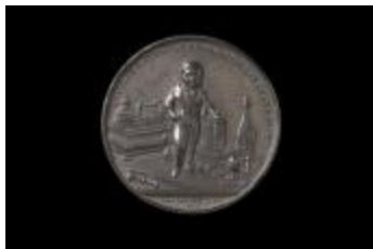
Physical object: Token featuring Charles S. Stratton (Gen. Tom Thumb), his history on reverse (2004.005.011)