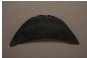
Textile: Bicorn hat belonging to Charles S. Stratton (EL 1988.126.001)