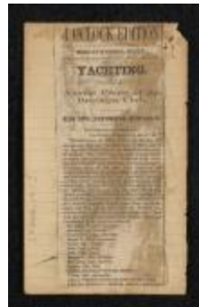
Newspaper: Article "Yachting" from Brooklyn Eagle listing Capt. Stratton (General Tom Thumb) (T 2016.019.001)