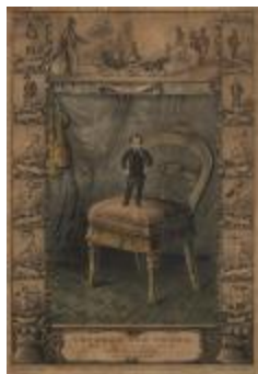
Print: "General Tom Thumb" by N. Currier (T 2013.024.001)