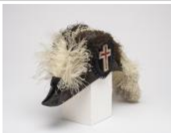
Textile: Masonic uniform hat belonging to Charles S. Stratton (2014.007.001 E)