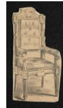
Toys and games: M. Lavinina Warren paper doll, arm chair (2003.009.062 I)