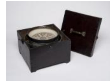
Equipment: Nautical compass owned by Charles S. Stratton (1939.008.001)