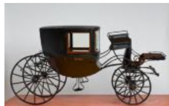
Transportation T & E: Miniature Carriage for General Tom Thumb (Charles S. Stratton) (1976.001.095)