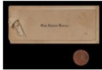
Calling card: Dual calling card for Miss Lavinia Warren and Charles S. Stratton (1981.002.001)