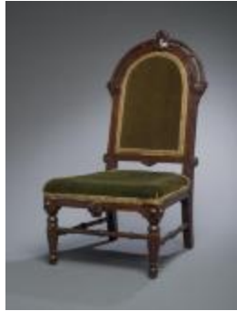
Furniture: Chair belonging to Charles S. Stratton (EL 1988.052.001)