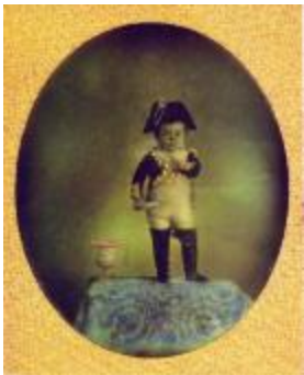
Photograph: General Tom Thumb (Charles S. Stratton) as Napoleon (1943.003.001)