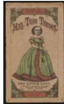
Toys and games: M. Lavinia Warren paper doll set (partial) with two dresses (EL 1988.106.001)