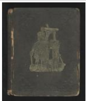
Book: "Life and Travels of Thomas Thumb in the United States, England, France, and Belgium with Illustrations of Him in His Different