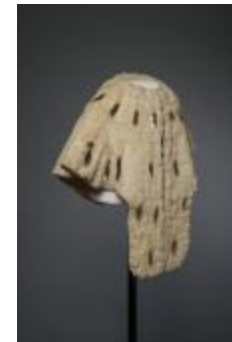
Textile: Fur cape belonging to M. Lavinia Warren (1976.001.035)