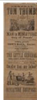
Advertisement: Broadside "General Tom Thumb, Man in Miniature, arriving in Exeter" (T 2013.010.001)