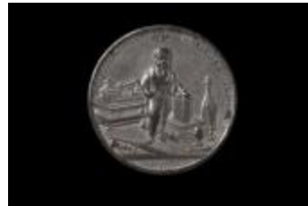
Souvenir: Token featuring Charles S. Stratton (Gen. Tom Thumb), his chariot on reverse (T 2017.002.001)