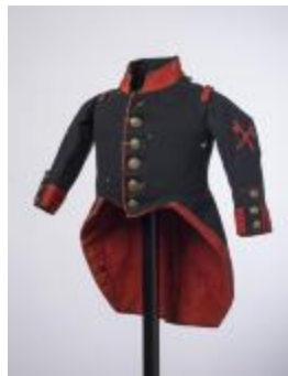
Textile: Military style jacket belonging to Charles S. Stratton (2014.006.001)