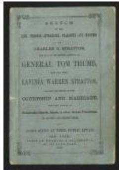
Book: "Sketch of the Life of General Tom Thumb and Lavinia Warren Stratton", 1867 (covers only) (T 2014.033.001)