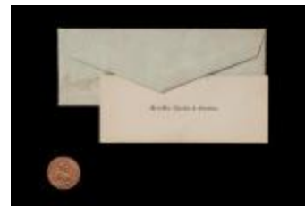
Physical object: Calling card for Mr. and Mrs. Charles S. Stratton (T 2016.026.001 AB)