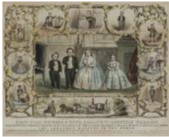
Print: "The Fairy Wedding" of General Tom Thumb (Charles S. Stratton) by Currier and Ives (T 2016.048.001)