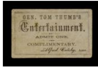
Ticket: "Gen. Tom Thumb's Entertainment" (EL 1988.266.001)