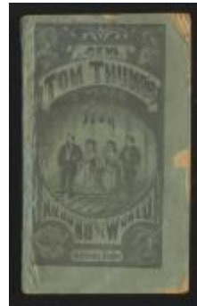
Book: "Tom Thumb's Three Years Tour Around the World" (front and back covers only) (EL 1988.086.001)