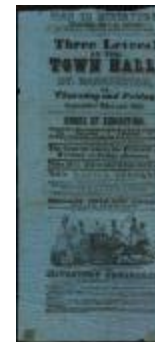
Advertisement: Handbill for "Man in Miniature (General Tom Thumb), arriving in Great Barrington" (2003.009.060)