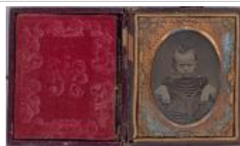
Wallace White Gould (DAG_Box1_08)