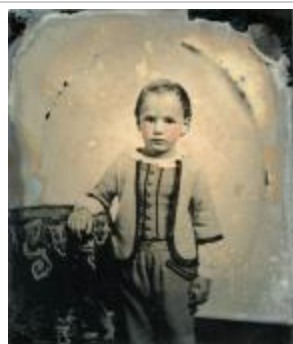
Portrait of Unknown Young Boy (81.11.5k)