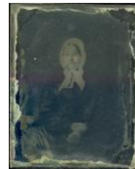
Portrait of Older Woman (William S. Platt's Mother) (81.11.5g)