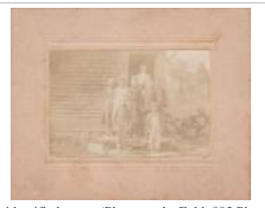
unidentified group (Photographs Fold. 003 Photo 073)