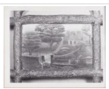
"Broad Brook School" by James E. Burdick framed (Photographs Fold. 003 photo 067)