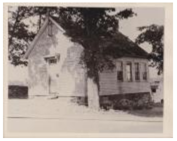
Palmer School (Photographs Fold. 003 Photo 069)