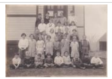
unidentified school group (Photographs Fold. 003 Photo 070-1)