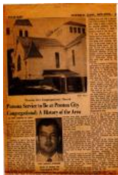
Pomona Service to Be at Preston City Congregational: A History of the Area (Coll. 003 Fold. 063 Doc. 022)