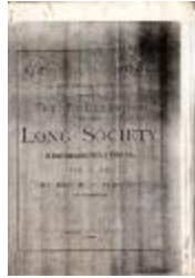
Copy of A Historic Discourse delivered at The Re-Dedication of the Long Society or Second Congregational Church, Preston, Conn. (Coll. 003 Fold. 068 Doc. 002)