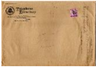
Rebuilding Long Society Church - 1817 & old papers (Coll. 003 Fold. 068 Doc. 001)