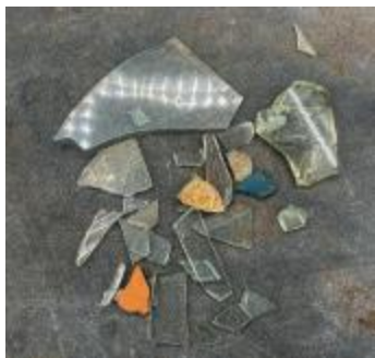
Mixed Items (95.70.M2)