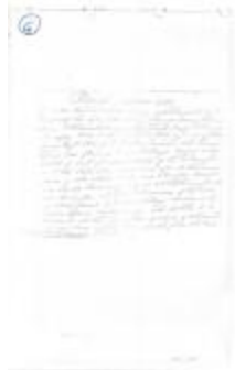
Photocopy of Note - Daniel Cook et al (Coll. 002 Fold. 008 Doc. 008)