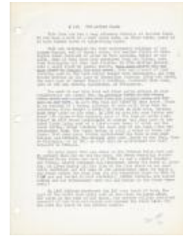
#156 The Luther Place (Coll. 003 Vol. 002 Doc. 088)