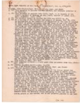
Notes from "Records of the State of Connecticut", vol 1, 1776-1778 (Coll. 003 Fold. 062 Doc. 002)