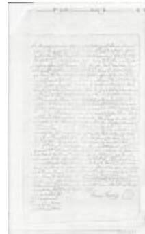
Photocopy of Thos Fanning Deed 1752 (Coll. 002 Fold. 008 Doc. 019)