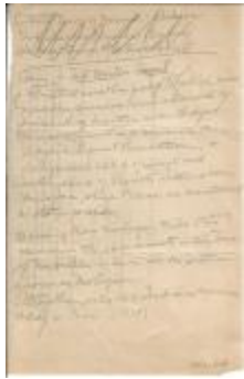
Descendants of the Pequot and Mohegan Tribes (Connecticut: Federal Writers Project) (Coll. 003 Fold. 066 Doc. 015)