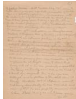
Notes from "The Downers of America" (Coll. 003 Fold. 015 Doc. 003)