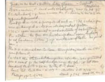
Guide to the History and Historic Sites of Connecticut (Crofut) (Coll. 003 Fold. 065 Doc. 002)