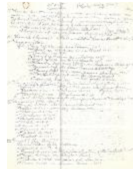
Hewitt Genealogy (Taken from Wheeler's History of Stonington) (Coll. 003 Fold. 026 Doc. 004)