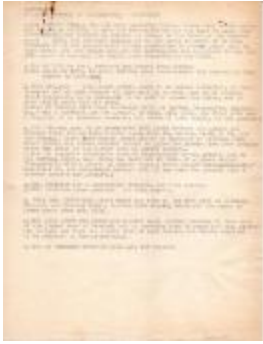
Volume III Colonial Records of Connecticut ---- 1678-1689 (Coll. 003 Fold. 062 Doc. 001)