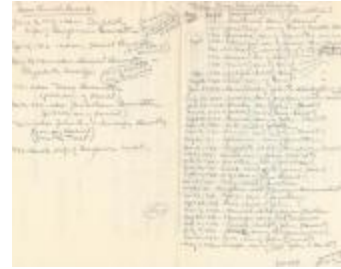
Brewster baptism church records - Marion Hall Notes (Coll. 003 Fold. 008 Doc. 009)