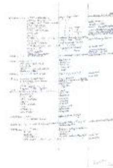
Church Membership - Preston City Congregational Church 1697 - 1976 (Coll. 003 Fold. 059 Doc. 002)