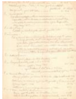
M. Hall's Notes from col. VI of Preston City Congregational Church Records (Coll. 003 Fold. 063 Doc. 025)