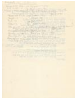
Bowdish records (Coll. 003 Fold. 053 Doc. 011)