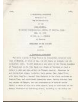
A Historical Discourse Delivered at The Re-Dedication of the Long Society, or Second Congregational Church, of Preston, Conn. (Coll. 003 Fold. 008 Doc. 009)