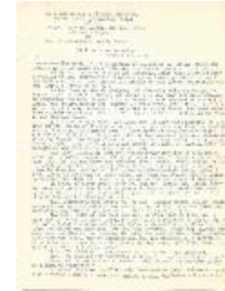
Semi-Centennial Historical Discourse (Coll. 003 Fold. 039 Doc. 001)